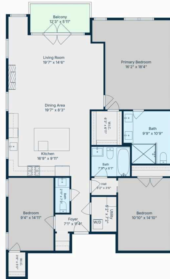
Floor Plan Created By Cubicasa App. Measurements Deemed Highly Reliable But Not Guaranteed.