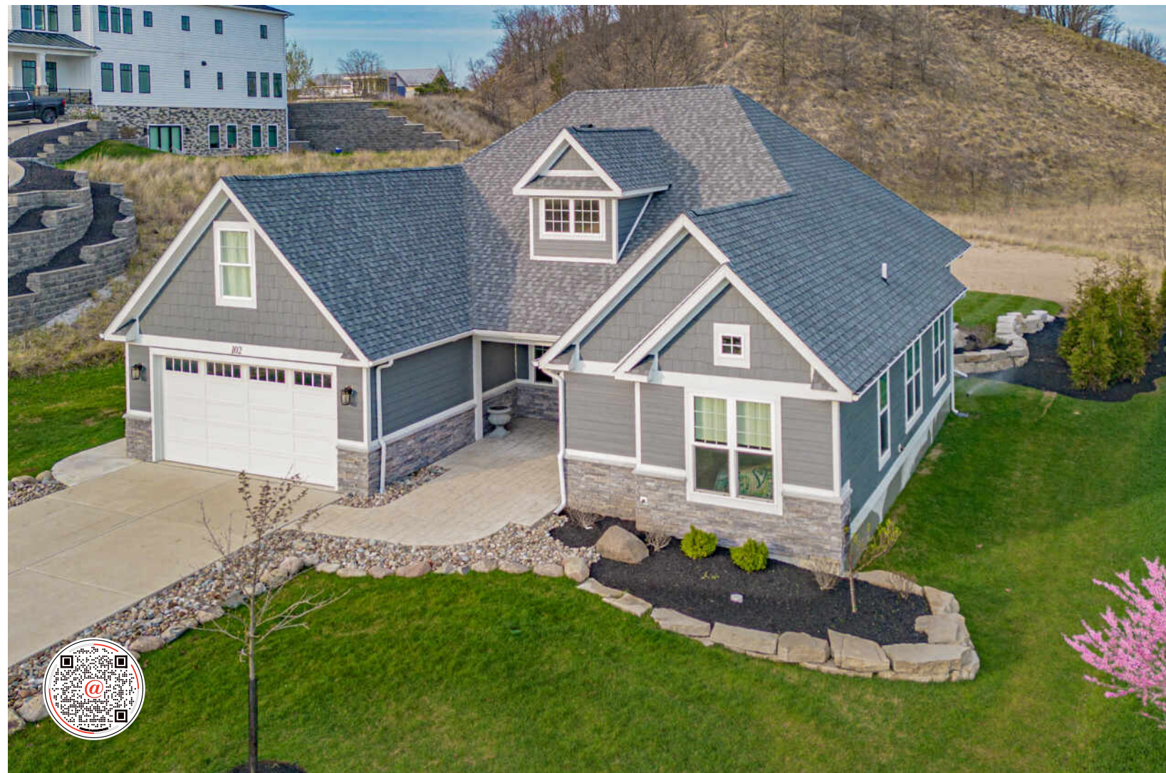
102 WHISPER DUNES DRIVE MICHIGAN CITY