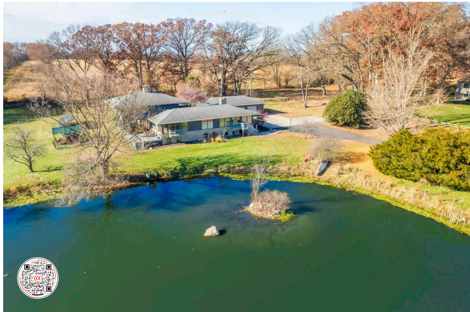
1050 COOLWOOD DRIVE VALPARAISO