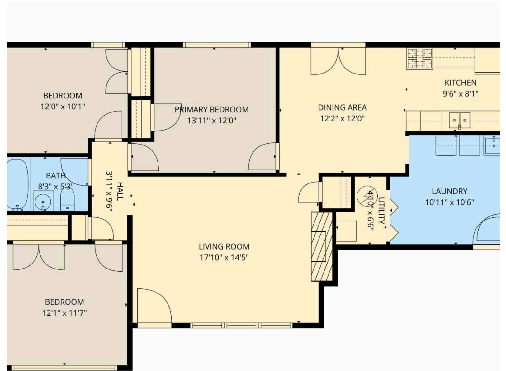
FLOOR PLAN CREATED BY CUBICASA APP. MEASUREMENTS DEEMED HIGHLY RELIABLE BUT NOT GUARANTEED.