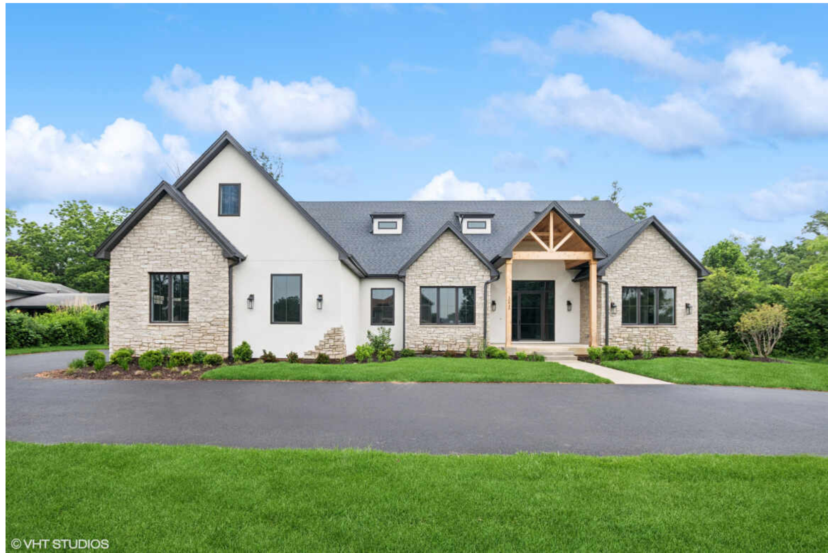
10940 GERMAN CHURCH ROAD • LA GRANGE

@properties | CHRISTIE'S INTERNATIONAL REAL ESTATE