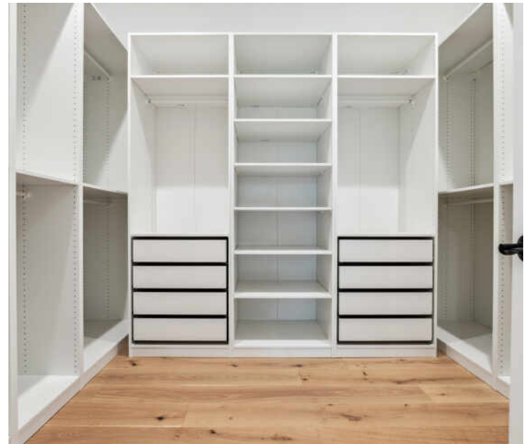
PRIMARY BEDROOM CLOSET