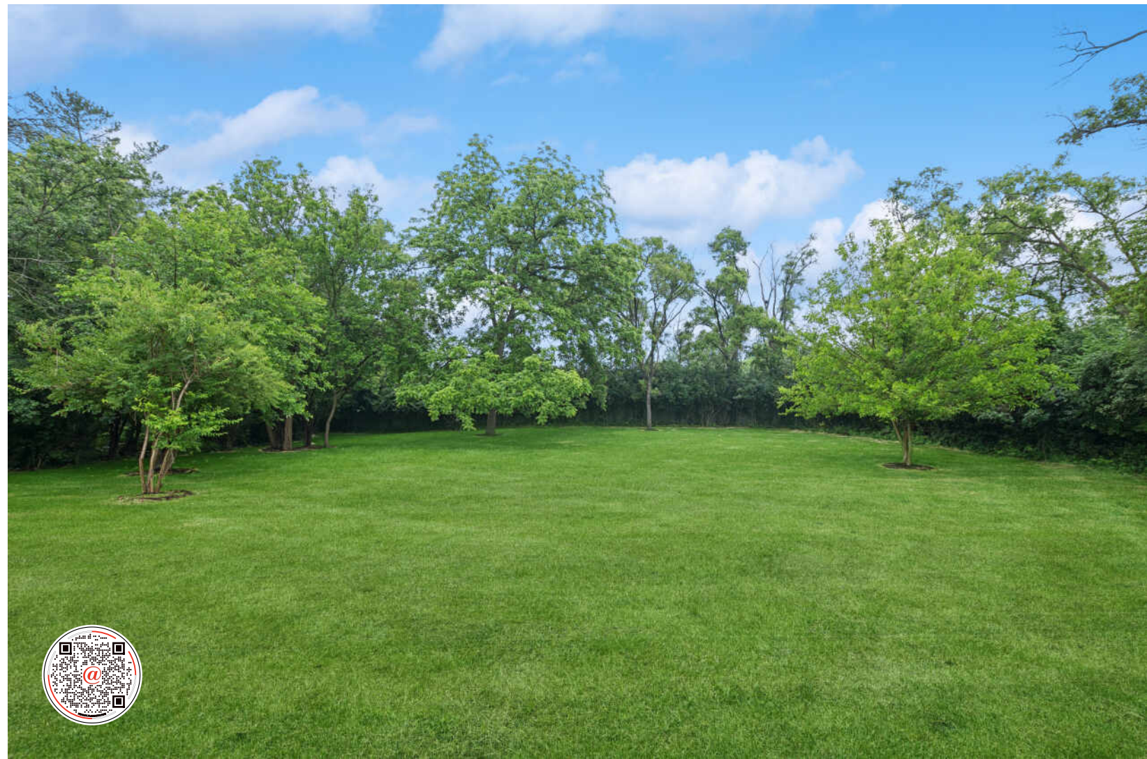
10940 GERMAN CHURCH ROAD LA GRANGE