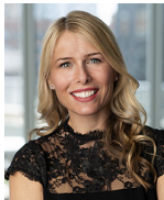
ELIZABETH AUGUST BROKER

Fantastic opportunity to own this updated stately center entrance 6 bed 6 bath- perfect flexible space for todays needs with home multiple home office and e-learning options! This impressive corner lot has so much curb appeal- custom wrought iron fencing, blue stone paved entry, professional landscaping and lighting, gorgeous tiled roof and attached 3 car garage. Upon entering the open foyer with original staircase that showcases a true blend of vintage details with todays updated finishes - stunning custom millworks and moldings, step down to newly updated massive formal living room with beautiful wbf, formal dining with beautiful light, updated windows, first floor office with gorgeous wood paneling and stained glass doors. Complete amazing kitchen renovation with gorgeous custom cabinetry and countertops, high end appliances, spacious oversized eat in island plus perfect breakfast nook, so thoughtfully designed! Enjoy well appointed ensuite bedrooms all on the second level with two primary suite options! All updated baths, great closets and storage, custom lighting throughout this home. 5th and 6th bedrooms are perfect space for home offices or guest suites. Fully finished lower level with huge recreational room, playroom or home office/workout room, full bath and amazing storage. Great yard, blue stone and paved patio, sprinkler system, new fence- this home has so much to offer! Walk to school and parks- Welcome Home!