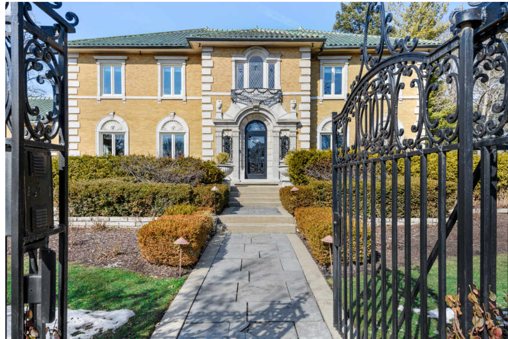
1101 N ELMWOOD AVENUE OAK PARK