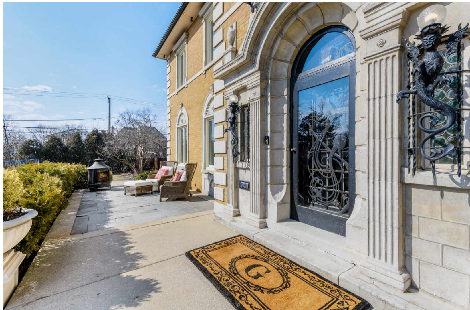
1101 N ELMWOOD AVENUE OAK PARK