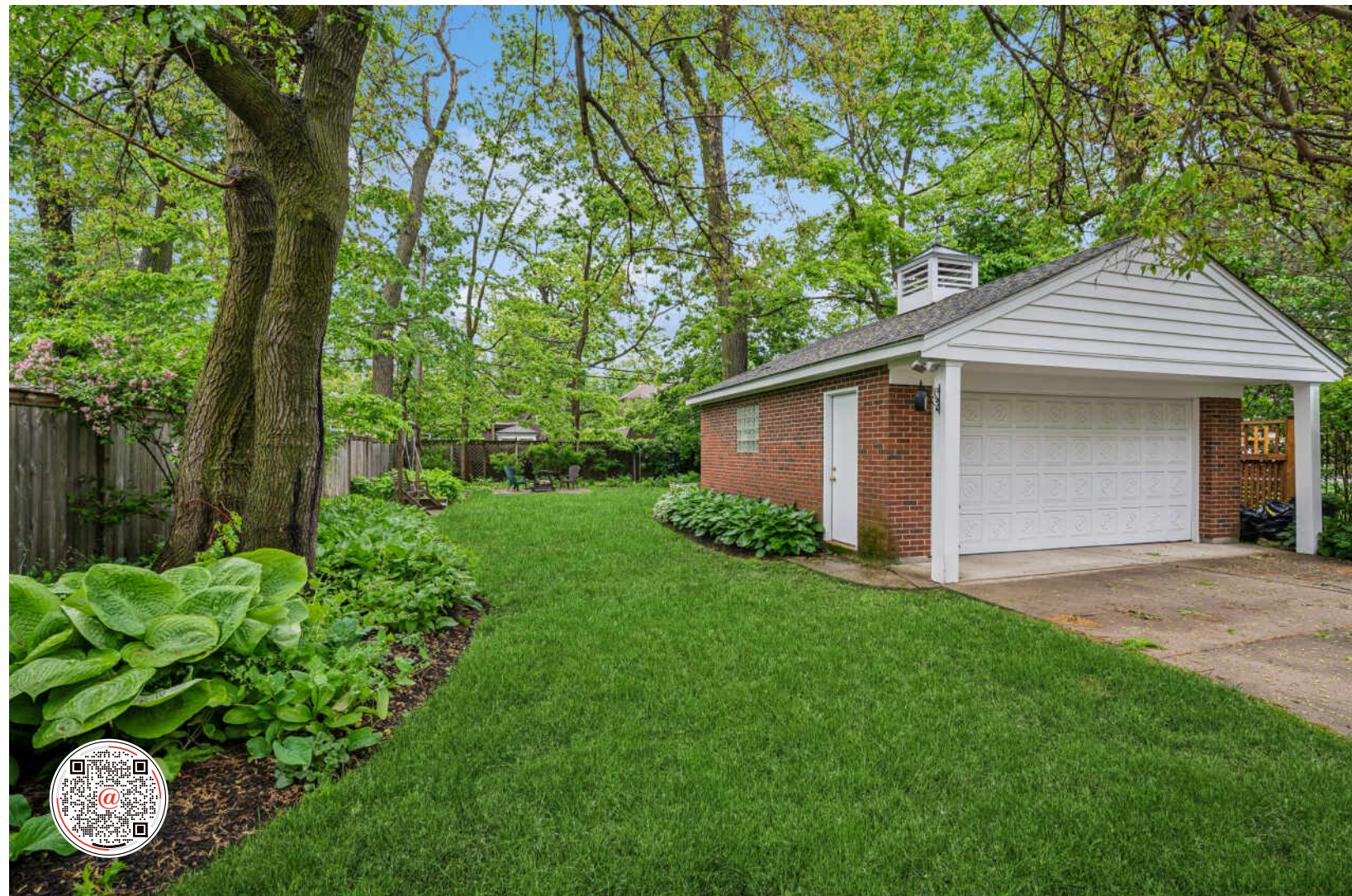
1117 KEYSTONE AVENUE RIVER FOREST