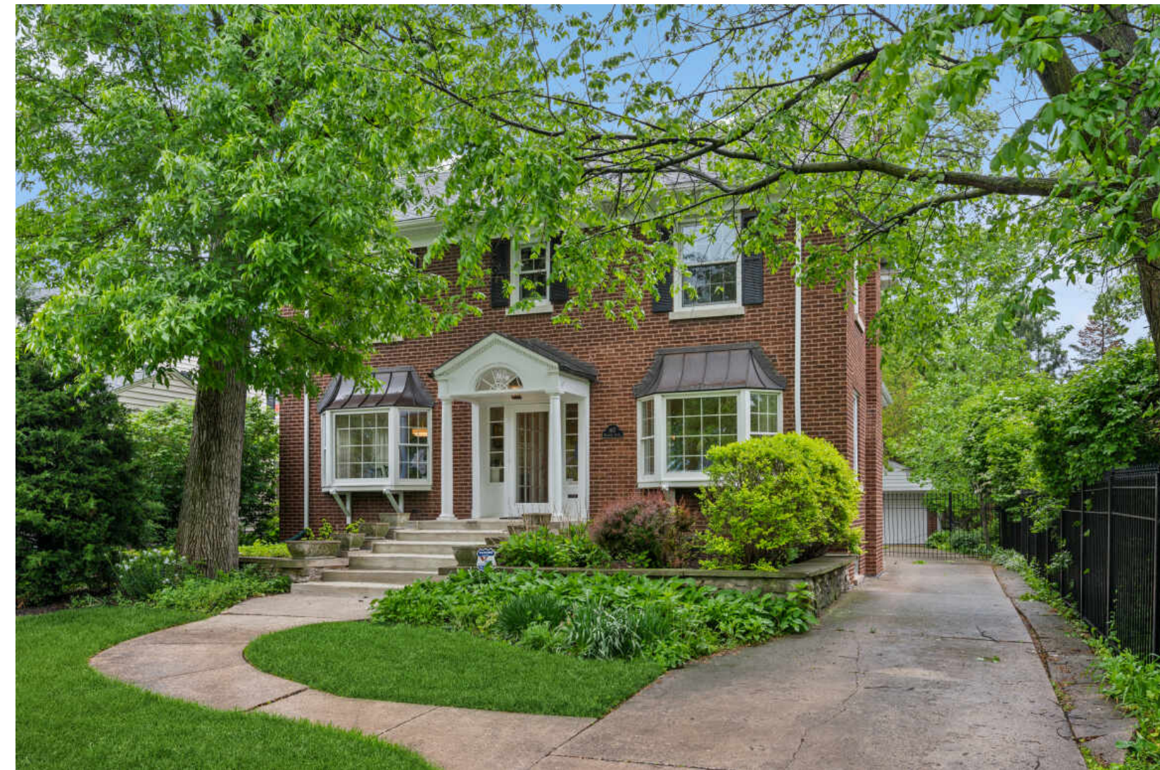
1117 KEYSTONE AVENUE • RIVER FOREST

@properties | CHRISTIE'S INTERNATIONAL REAL ESTATE