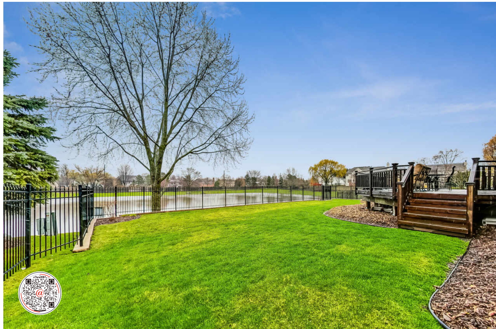
1124 JAIMEE LANE CONCORD AT INTERLAKEN | LIBERTYVILLE