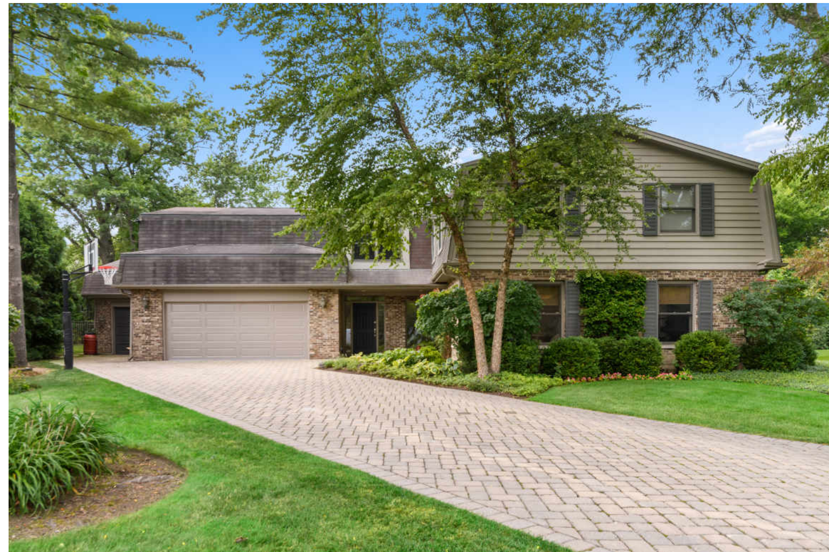
1150 HEATHER ROAD DEERFIELD