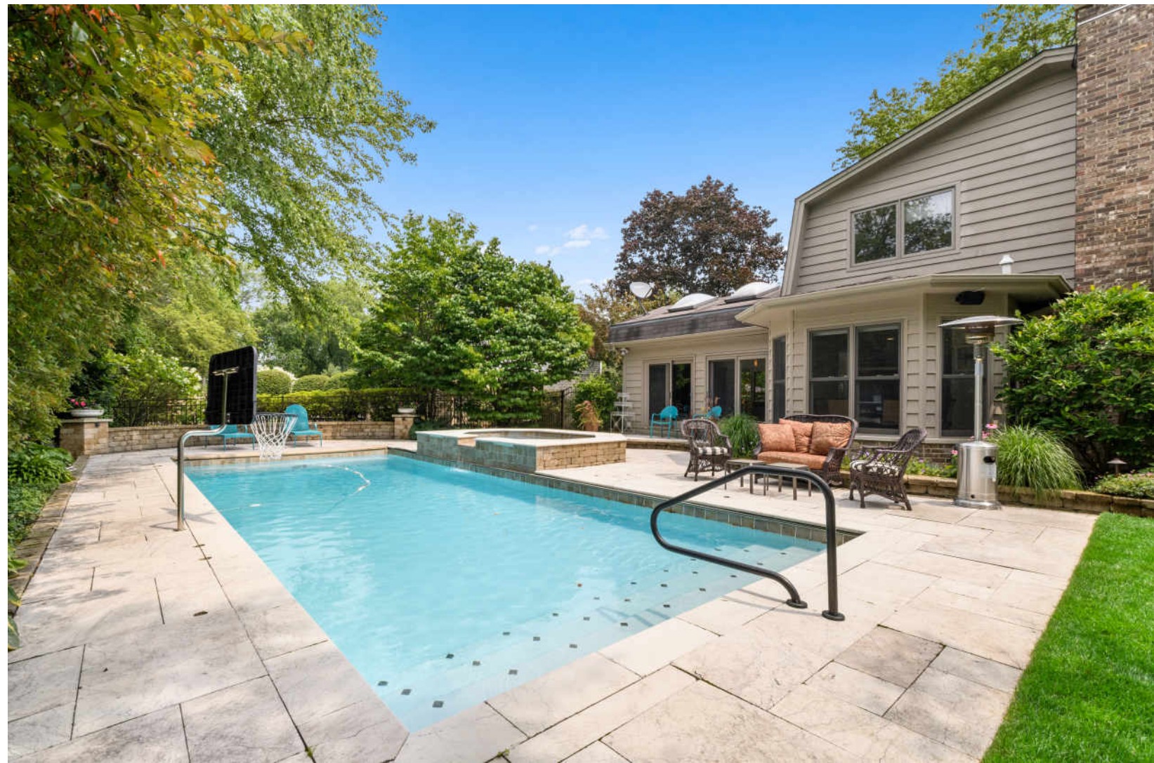
1150 HEATHER ROAD DEERFIELD