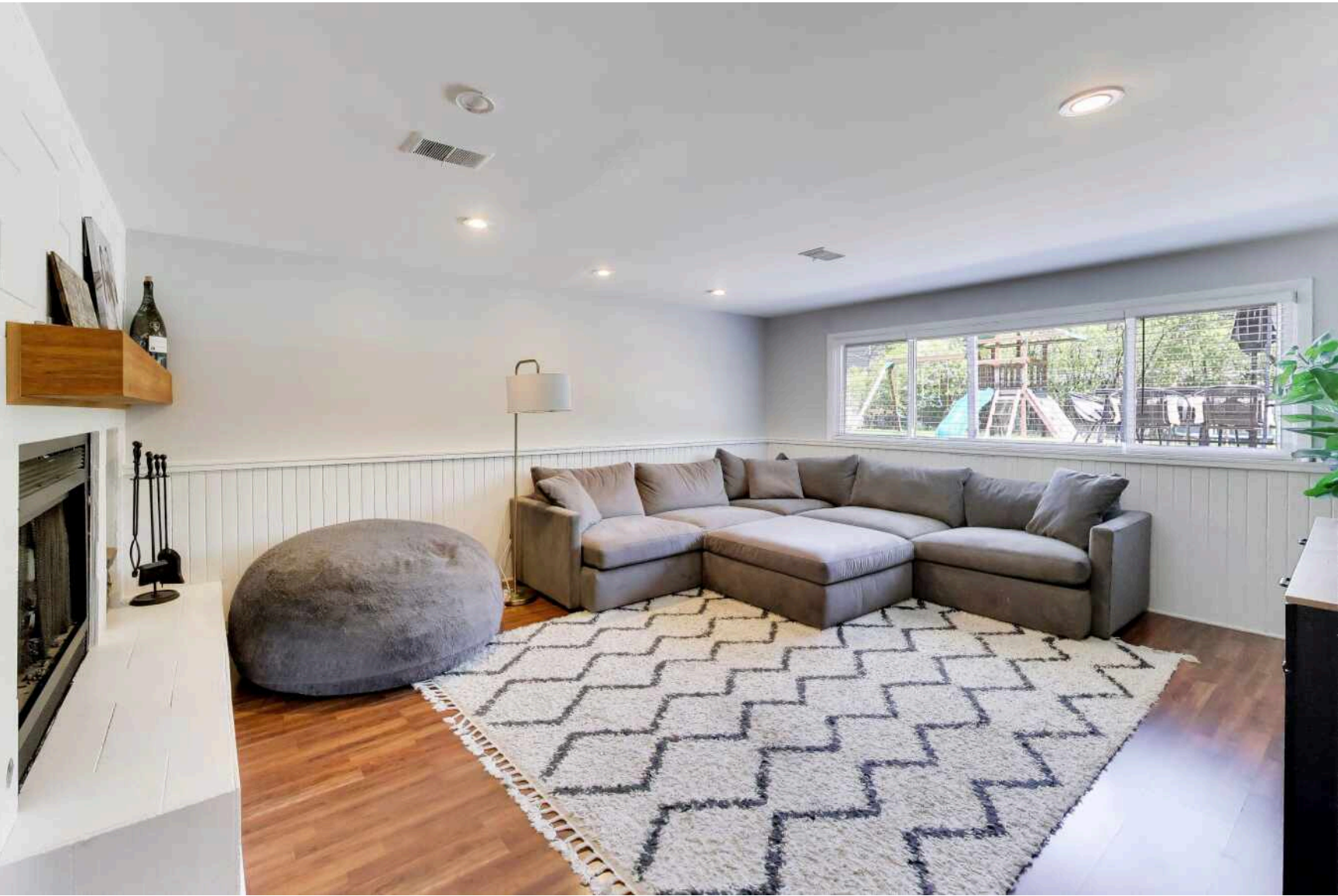
10 1153 KENTON ROAD