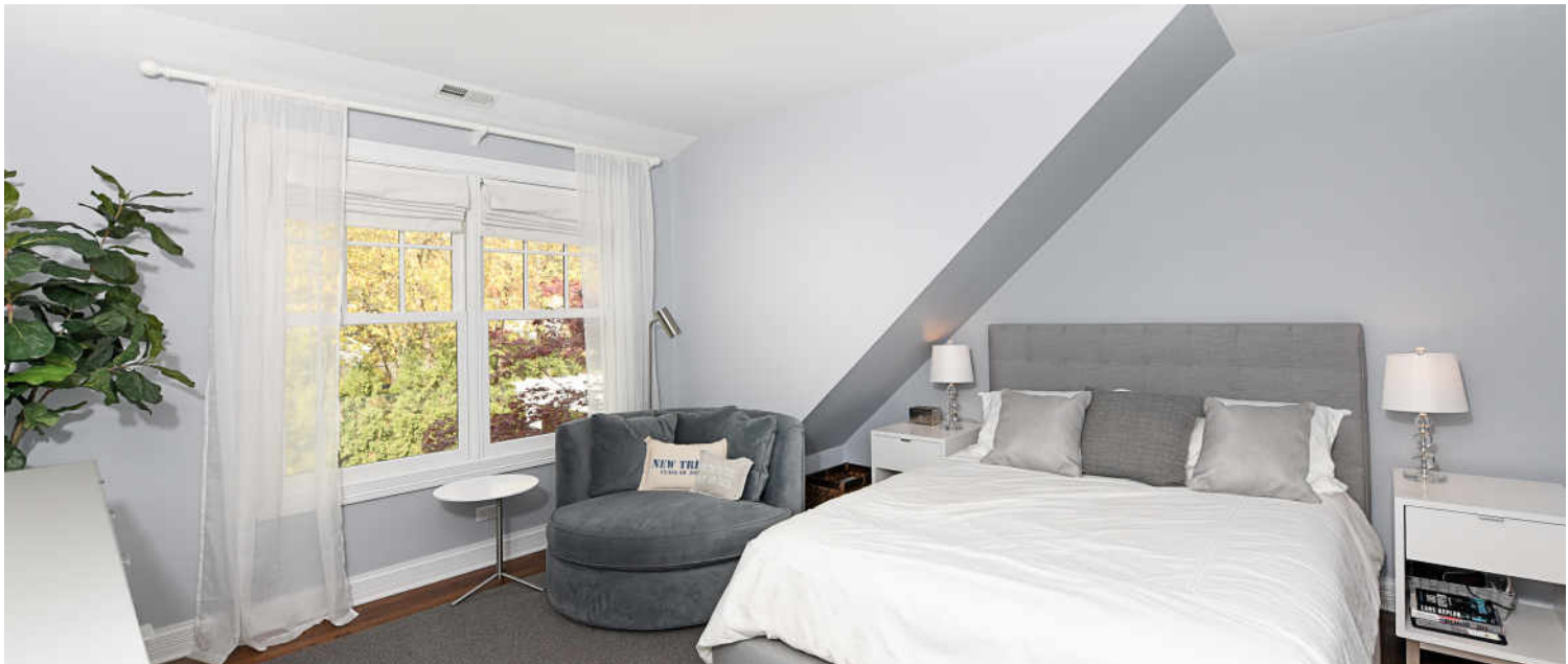
FAMILY BEDROOM 4