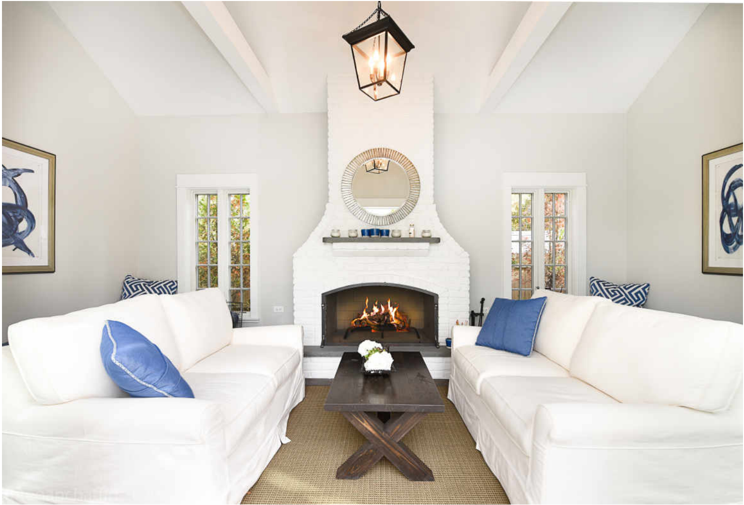
FIREPLACE IN POOL HOUSE