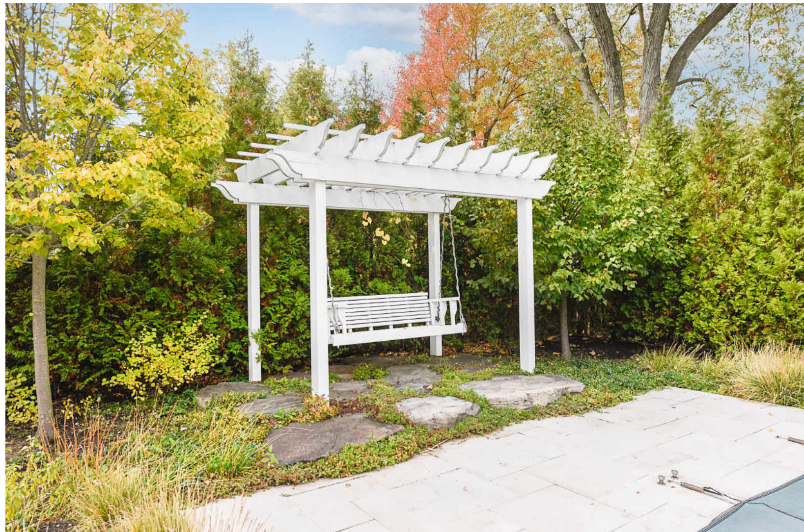
1225 SPRUCE STREET WINNETKA