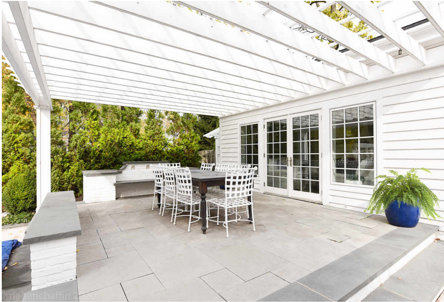
OUTDOOR KITCHEN AND ELEVATED DINING