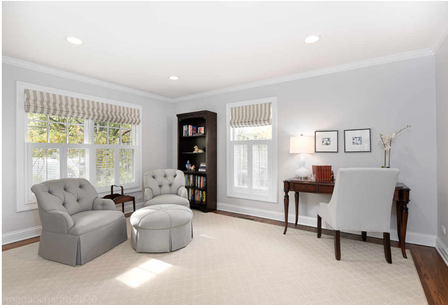
megachairns 2020 PRIMARY BEDROOM SITTING ROOM