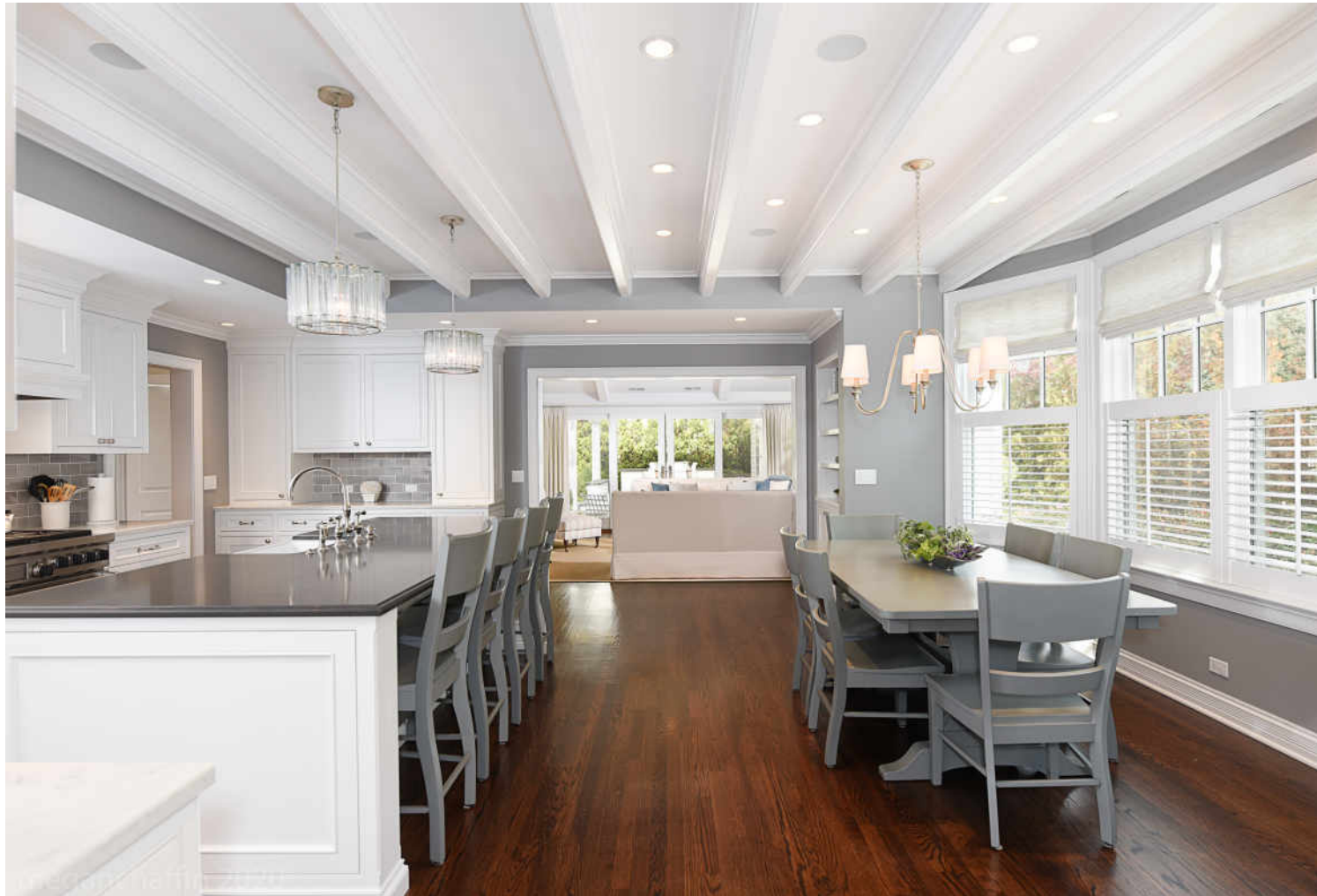
KITCHEN VIEW TO BACKYARD