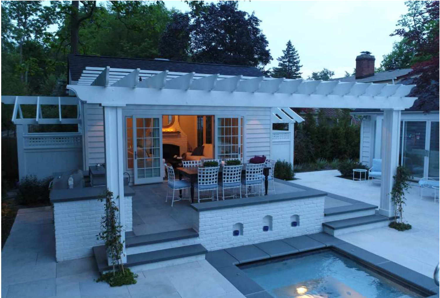
EVENING AT THE SPA