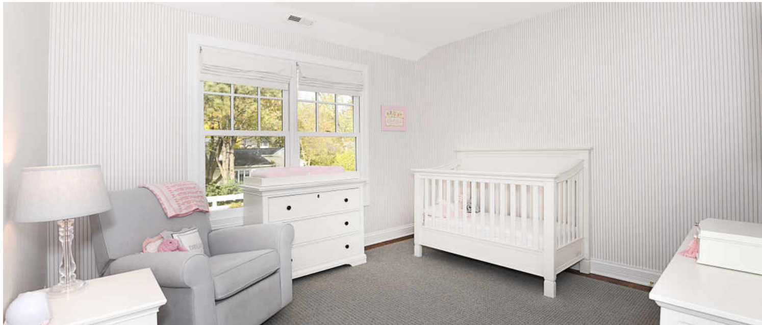
FAMILY BEDROOM 2