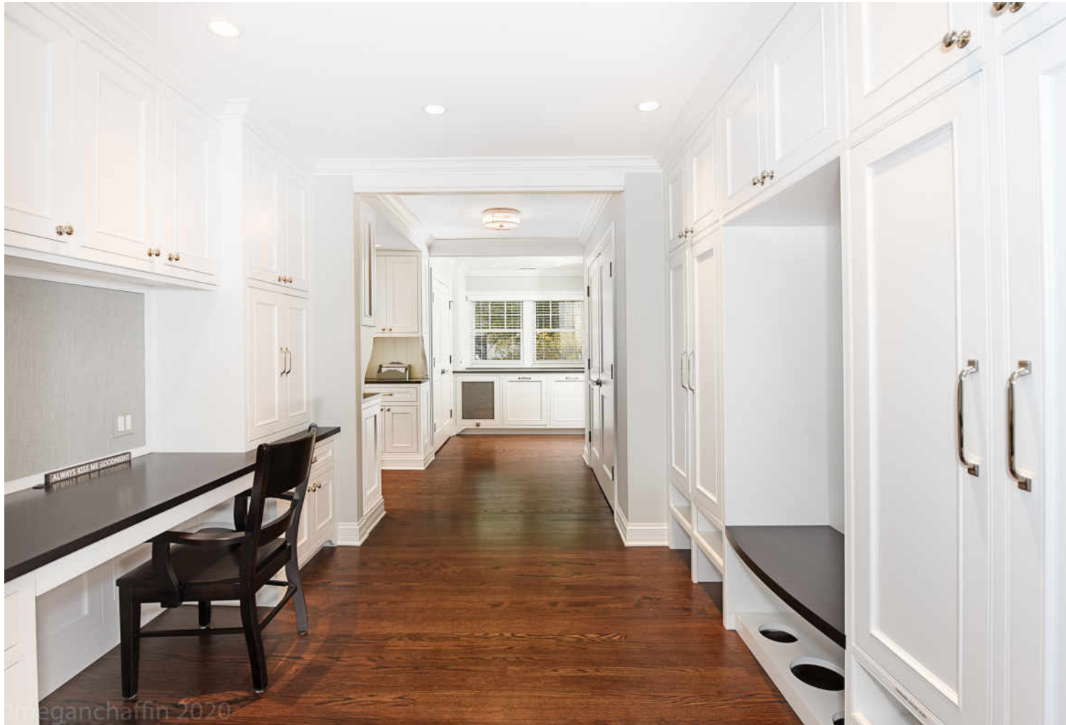
EXPANSIVE MUDROOM/FAMILY COMMAND CENTER