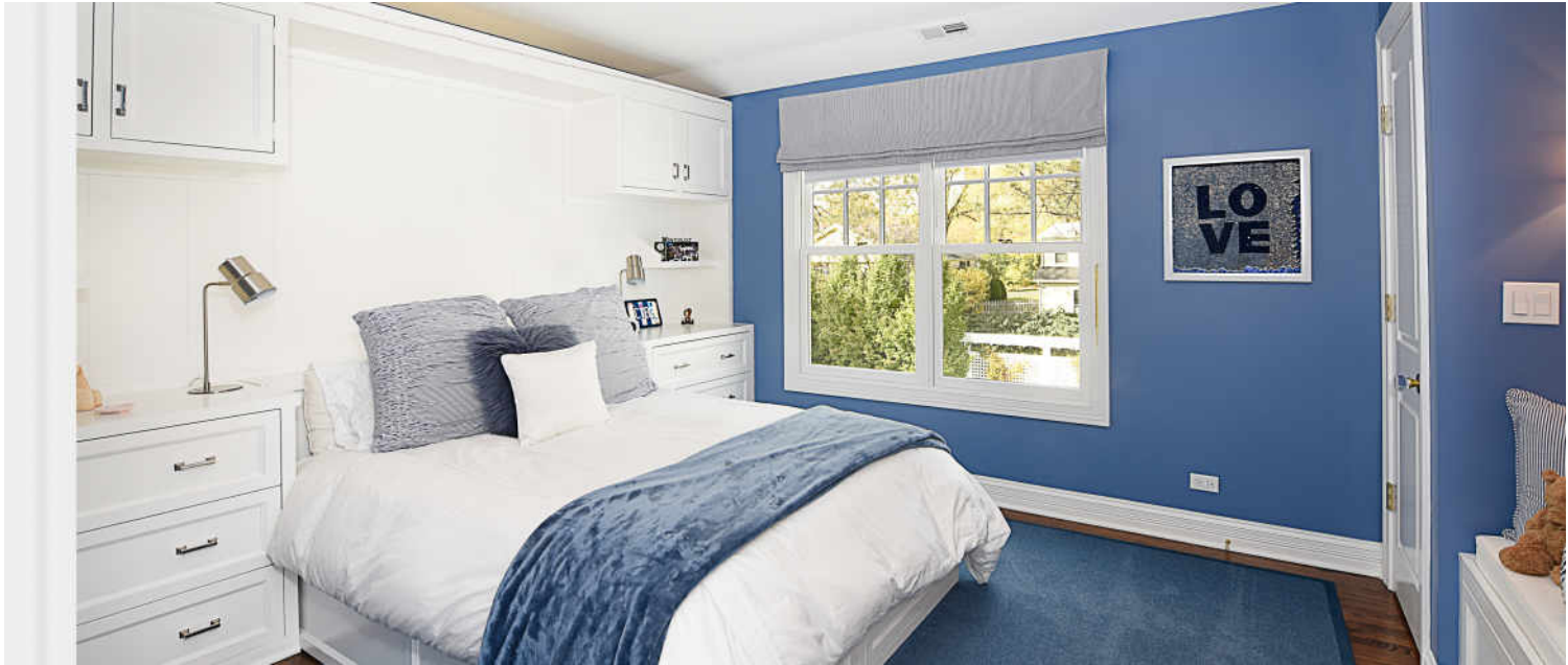
FAMILY BEDROOM 3