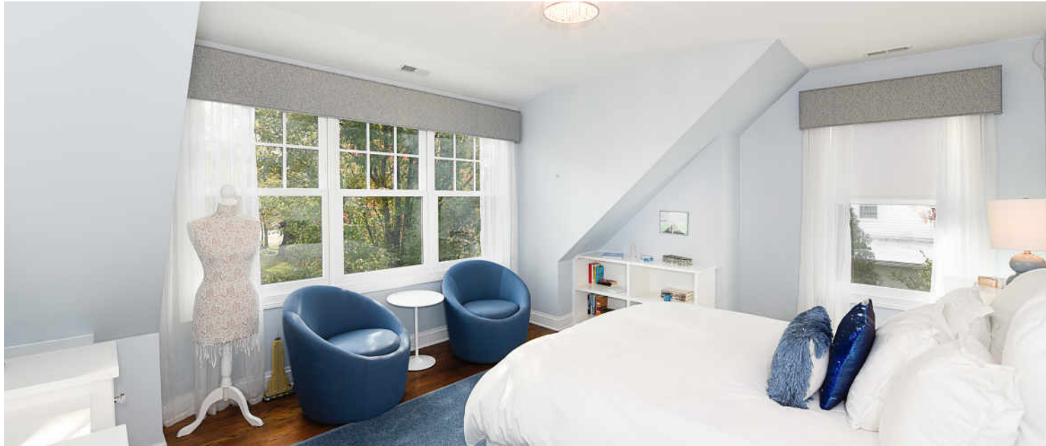
FAMILY BEDROOM 1