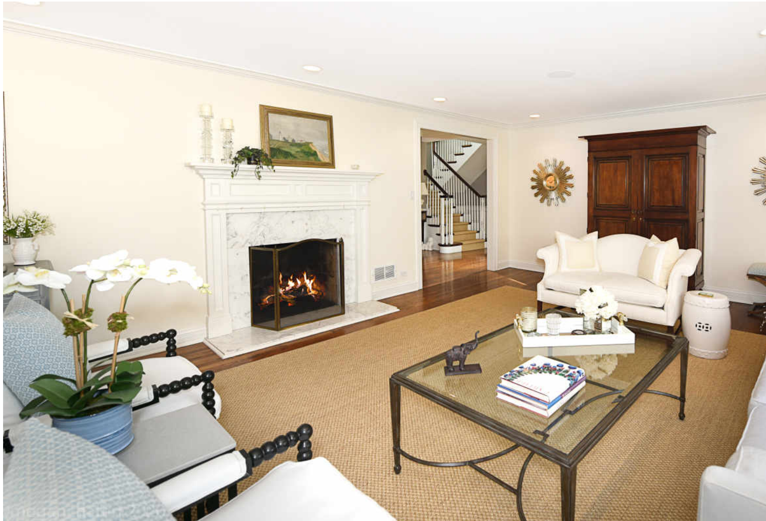
LIVING ROOM FIREPLACE