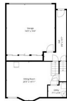
Not To Scale By Owner's Rep. Measurements Don't Always Add Up. See Us For More Details.