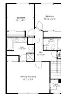
Not To Scale By Owner's Rep. Measurements Don't Always Add Up. See Us For More Details.