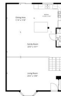
Not To Scale By Owner's Rep. Measurements Don't Always Add Up. See Us For More Details.