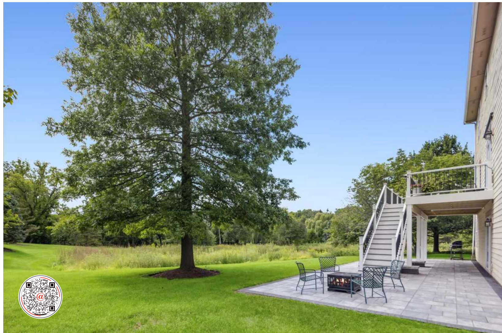
1432 CASCADE LANE BARRINGTON