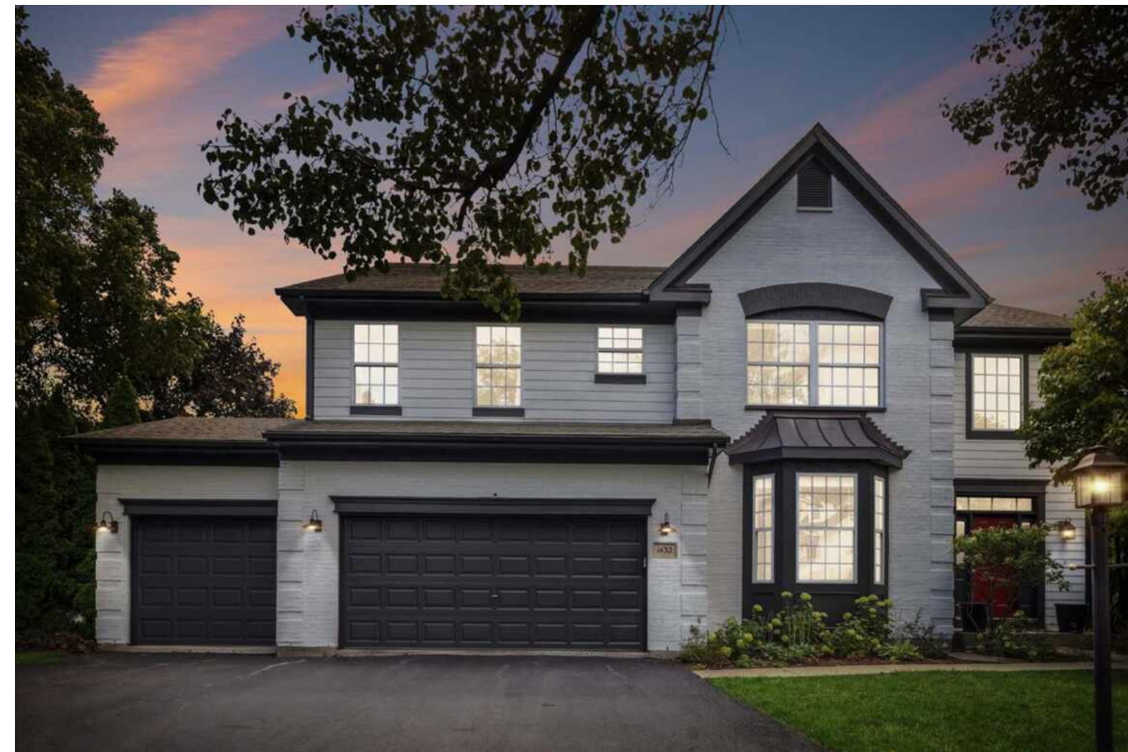
1432 CASCADE LANE • BARRINGTON

@properties | CHRISTIE'S INTERNATIONAL REAL ESTATE