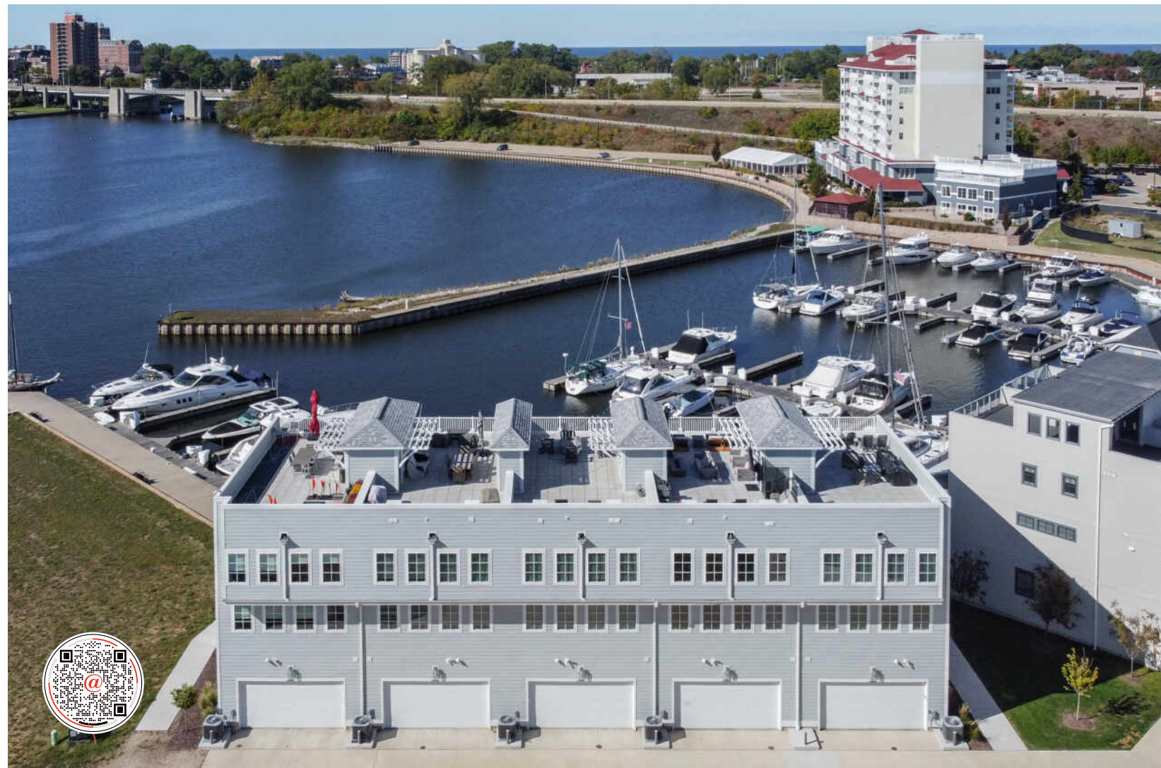
144 MARINERS COVE ST. JOSEPH