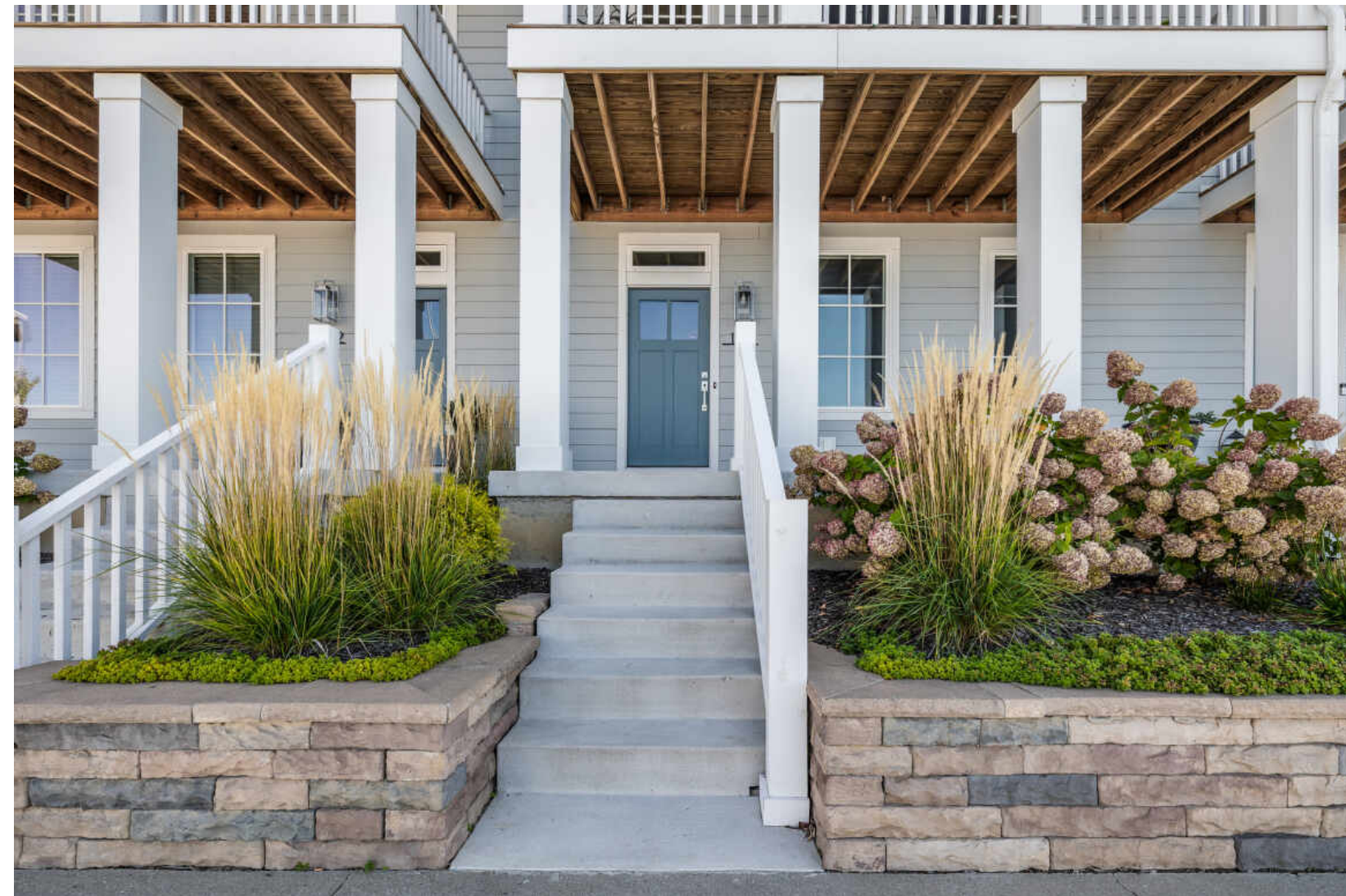
144 MARINERS COVE • ST. JOSEPH