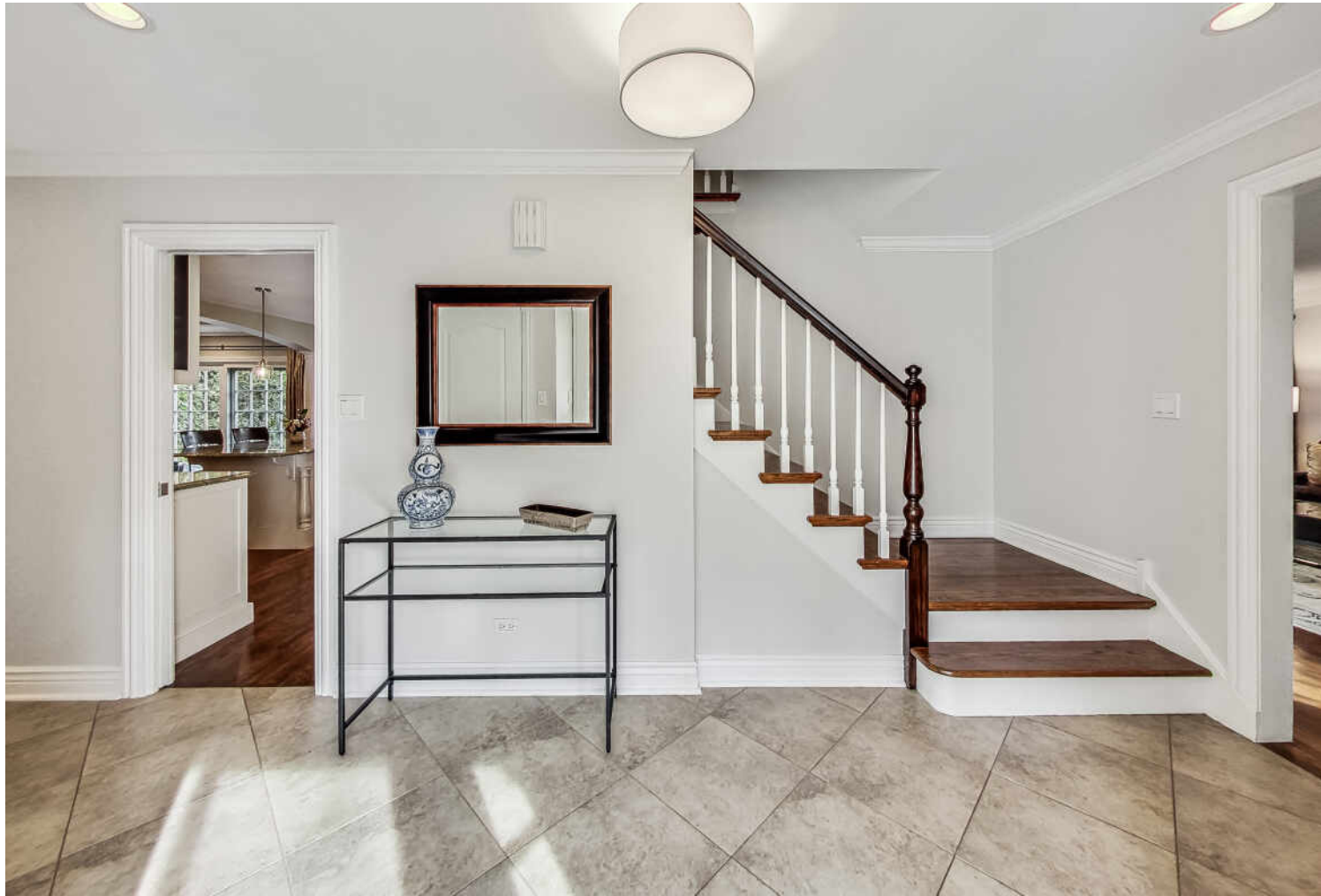
WELCOME TO 1508 CHAPEL COURT