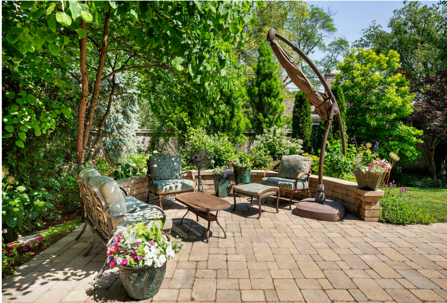
BACKYARD WITH MATURE PERENNIALS