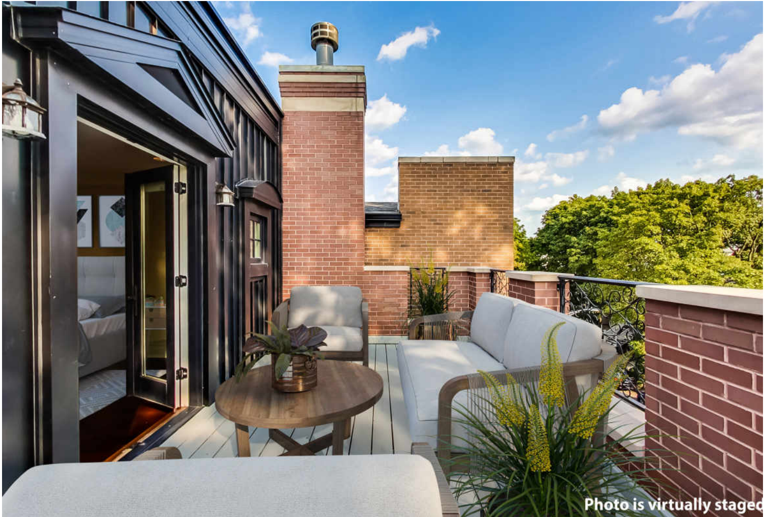
Photo is virtually staged