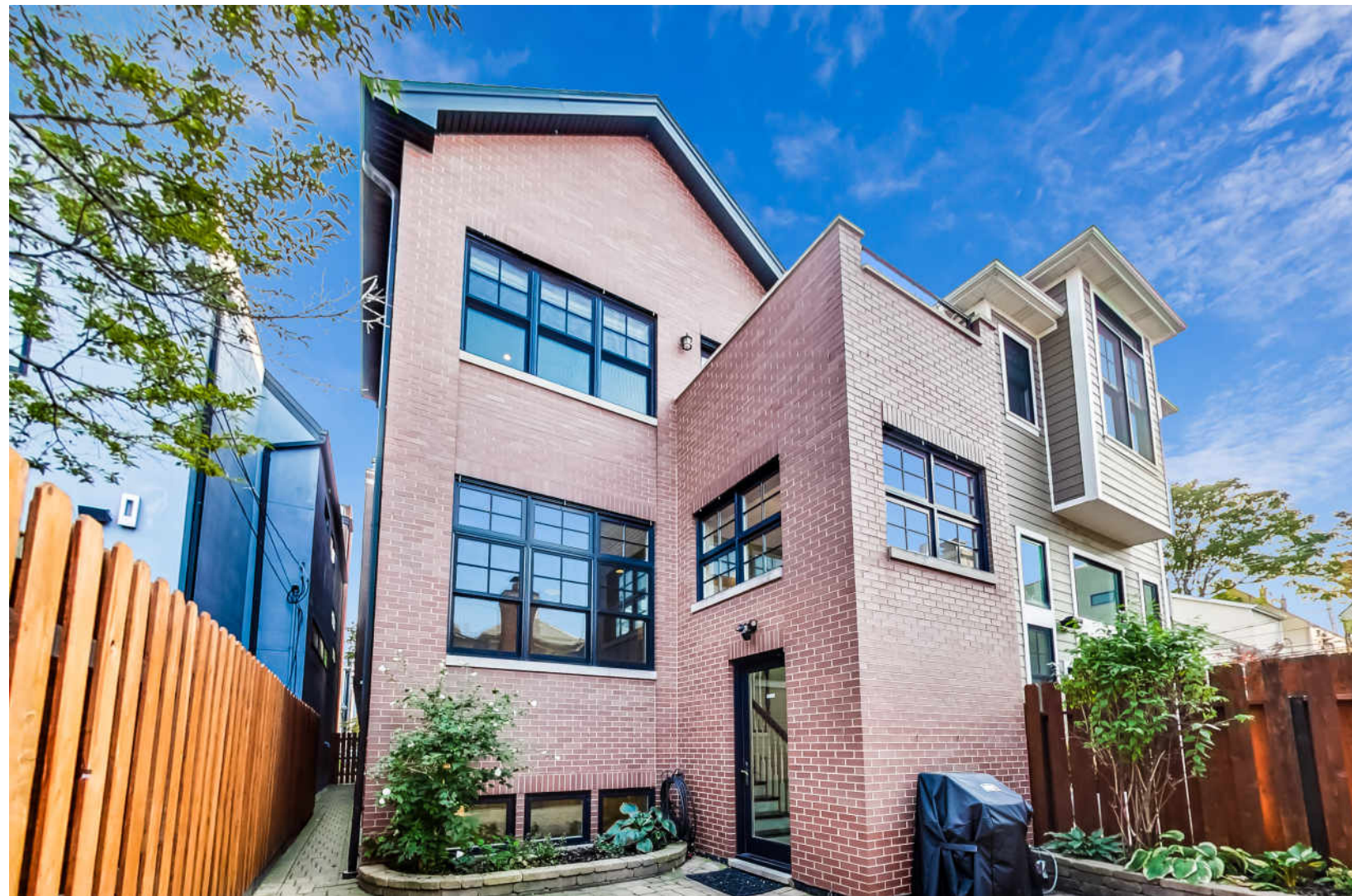
1536 W WELLINGTON AVENUE LAKEVIEW