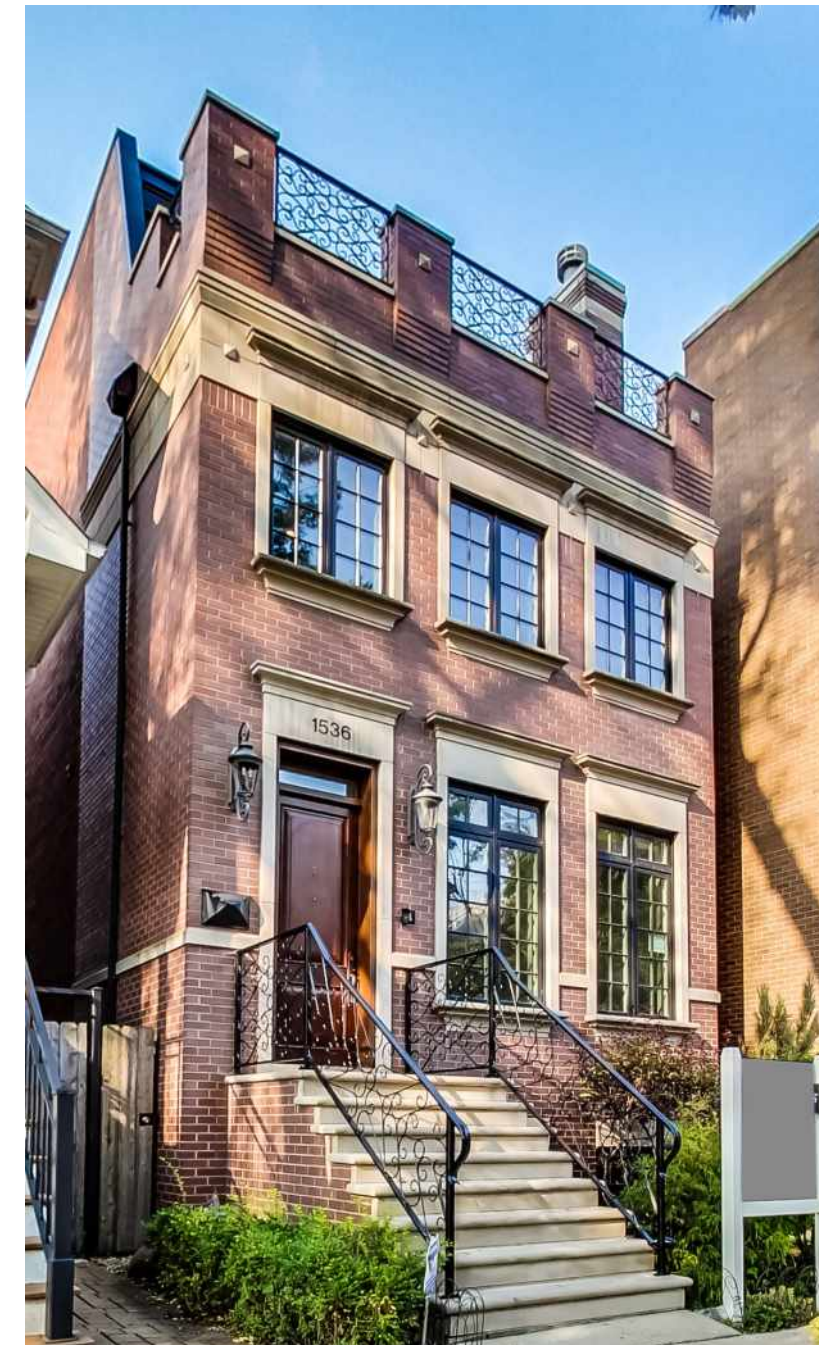
1536 W WELLINGTON AVENUE LAKEVIEW