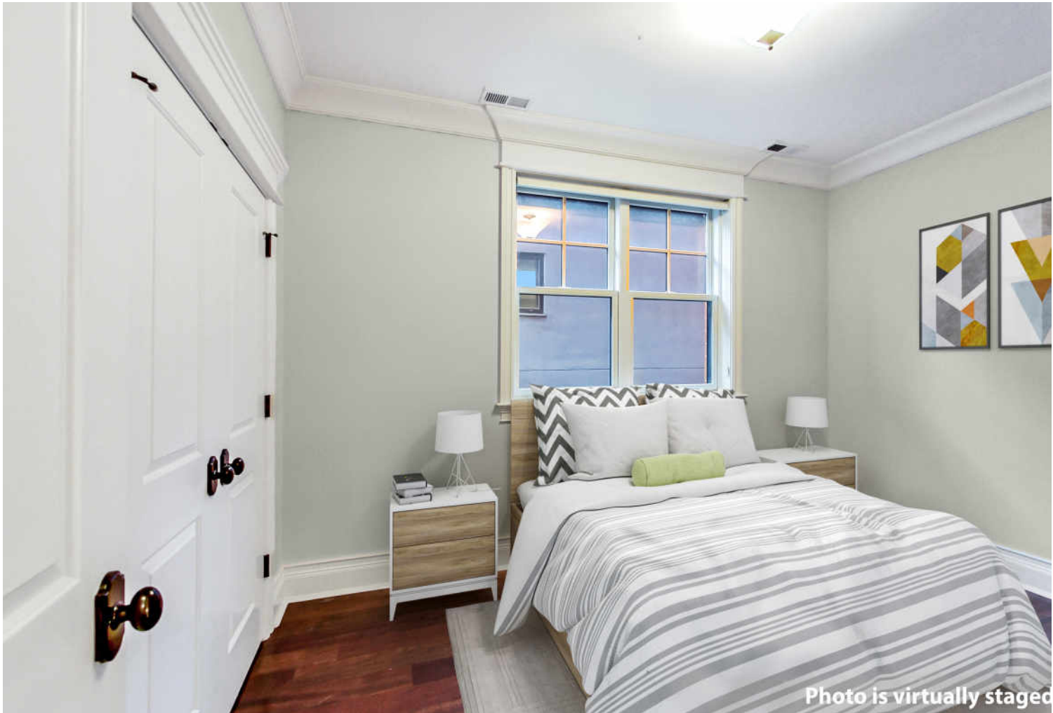
Photo is virtually staged