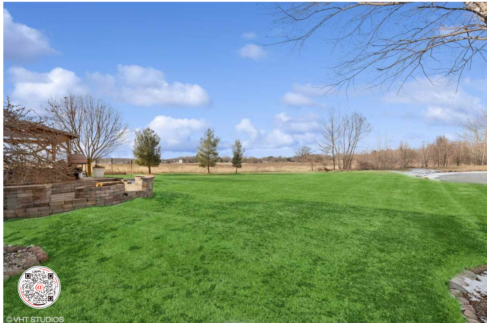
1556 VENETIAN BAY DRIVE TUSCANY NEIGHBORHOOD