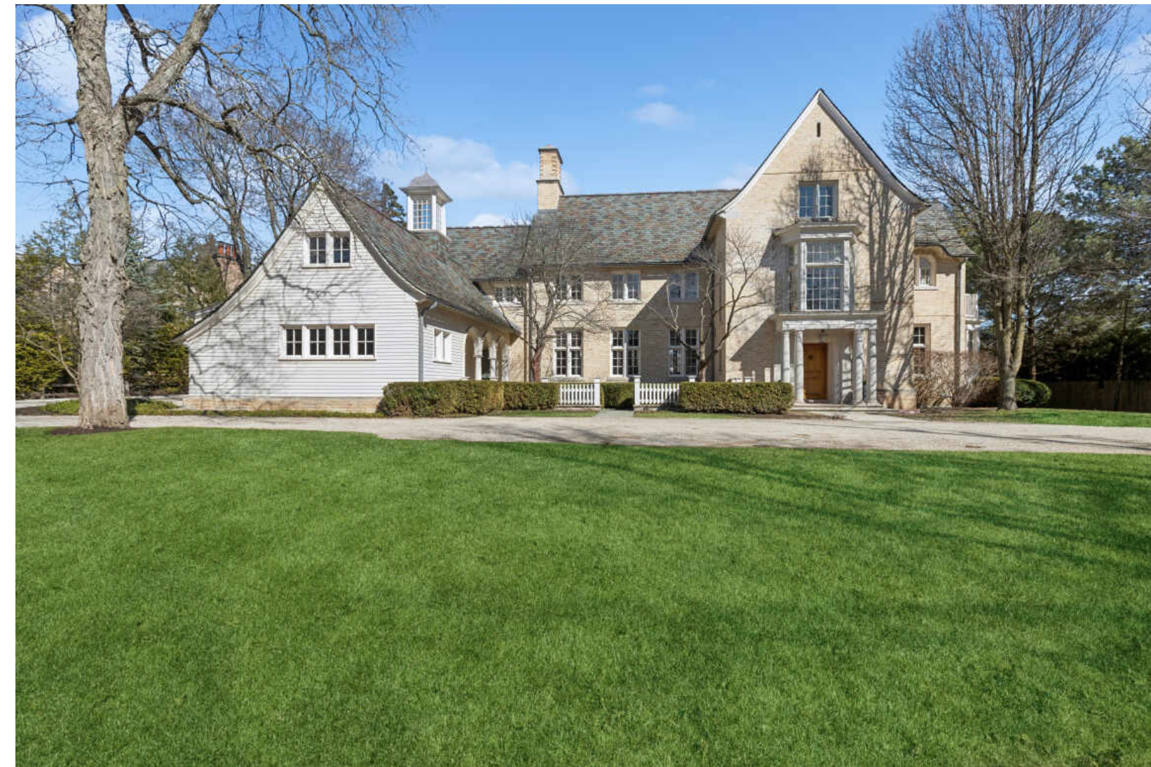
161 N SHERIDAN ROAD • LAKE FOREST