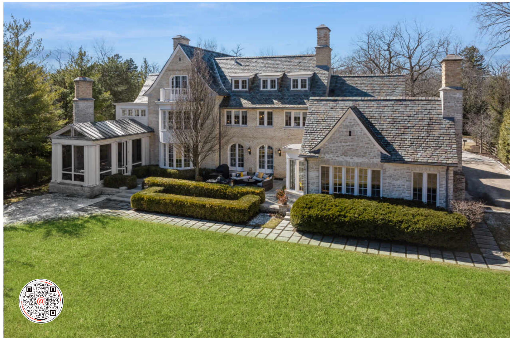
161 N SHERIDAN ROAD LAKE FOREST