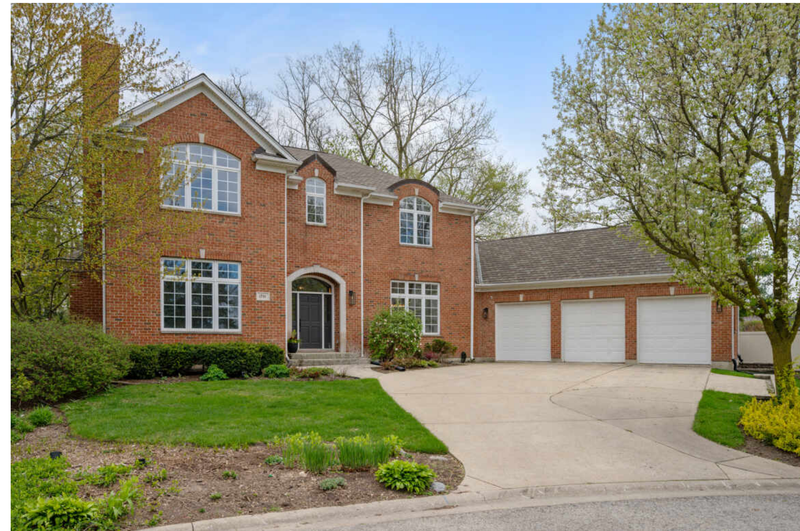
1701 KENDALE DRIVE • GLENVIEW