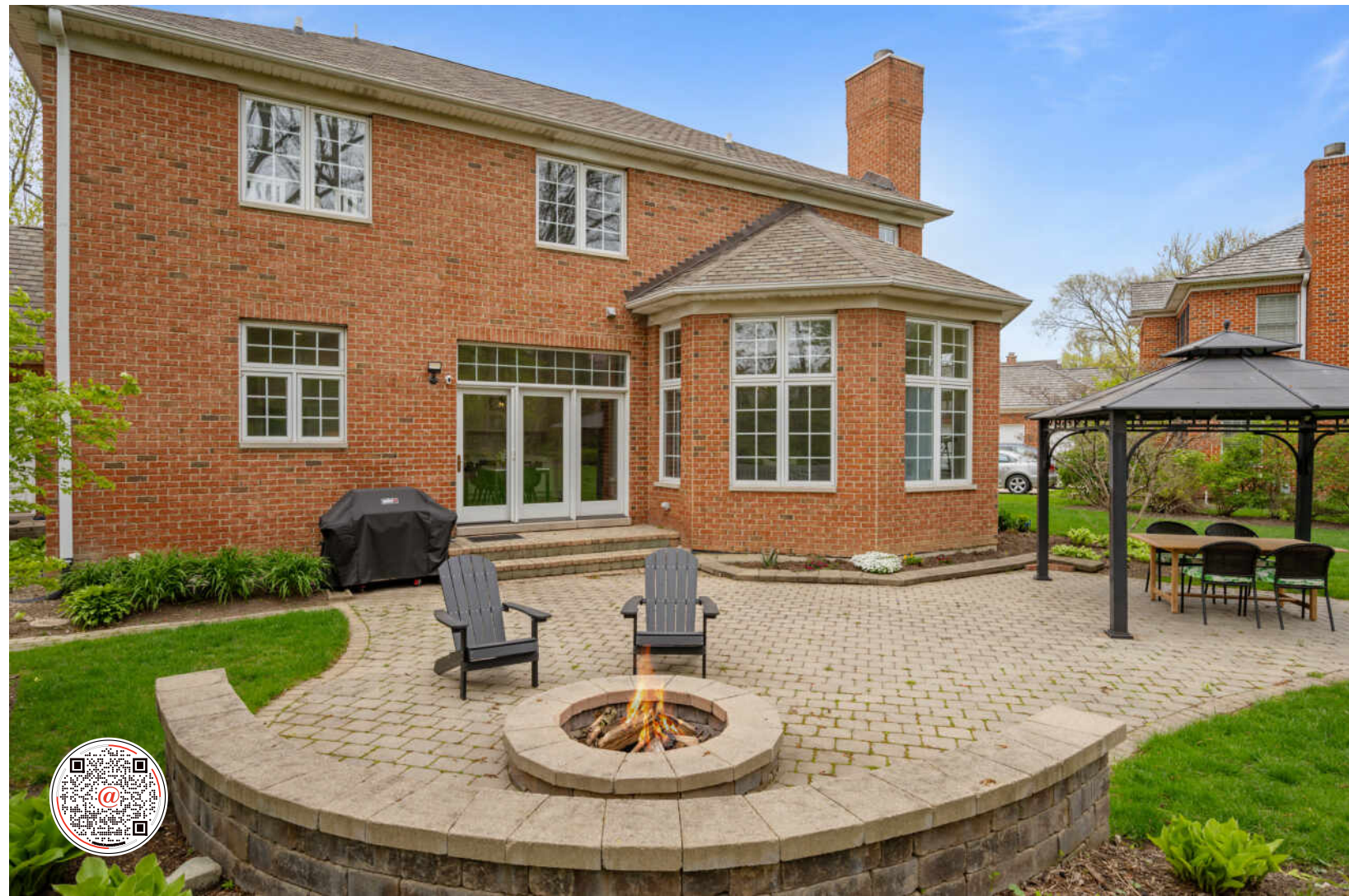
1701 KENDALE DRIVE GLENVIEW