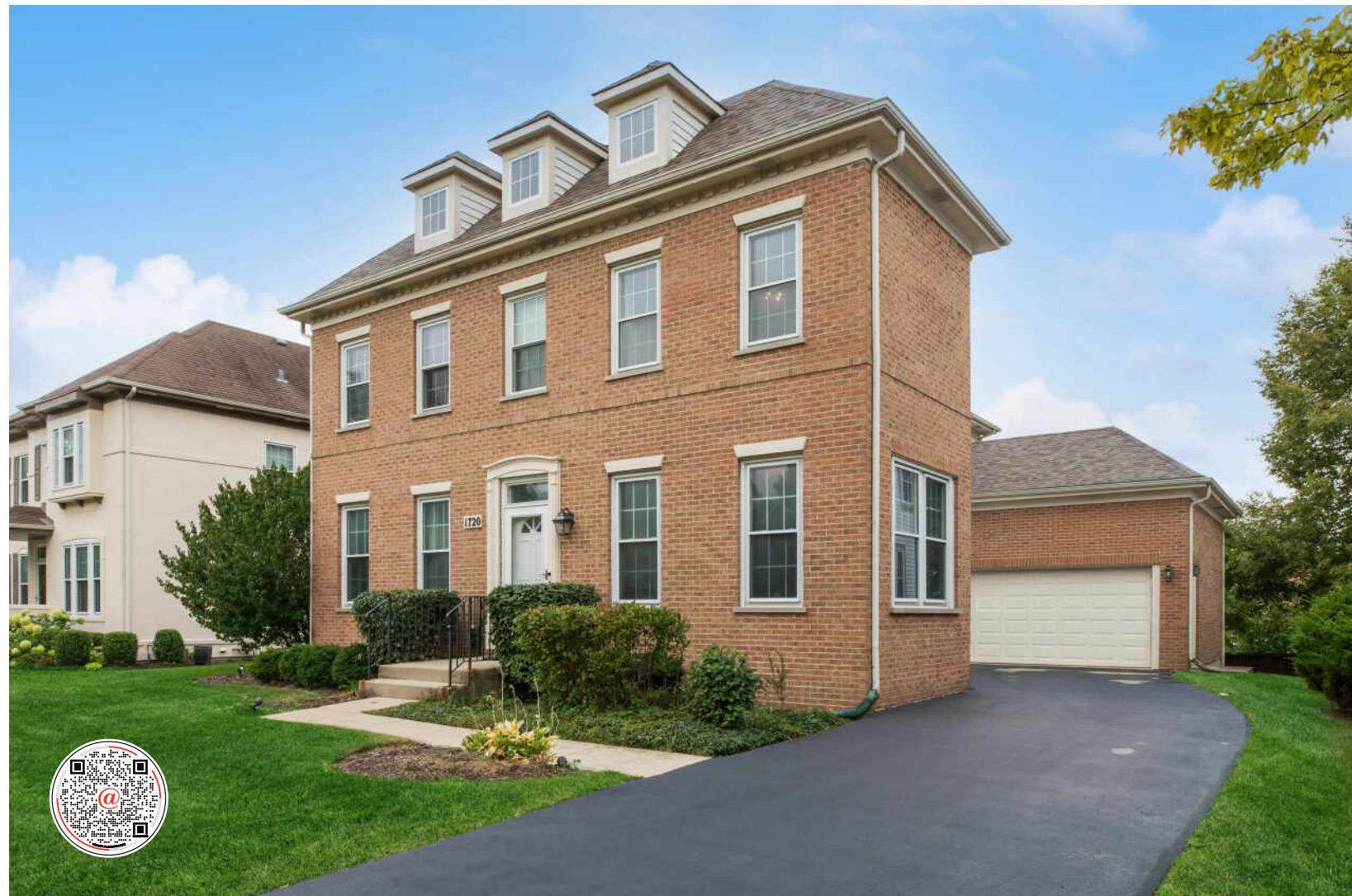
1720 NEWTON AVENUE PARK RIDGE