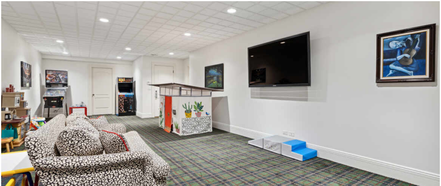
PLAY / RECREATIONAL ROOM