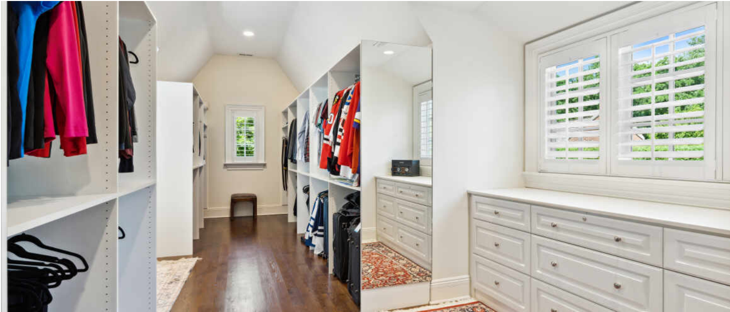
PRIMARY BEDROOM CLOSET