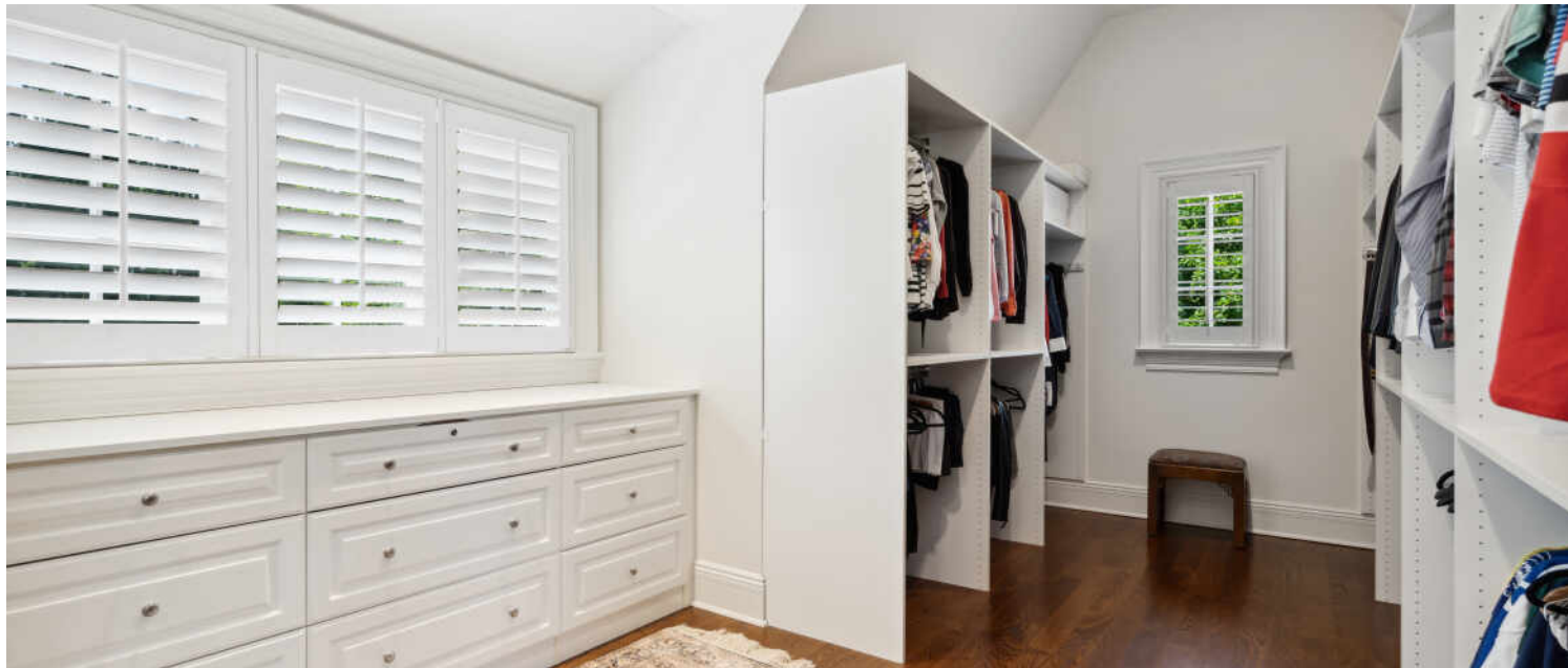
PRIMARY BEDROOM CLOSET