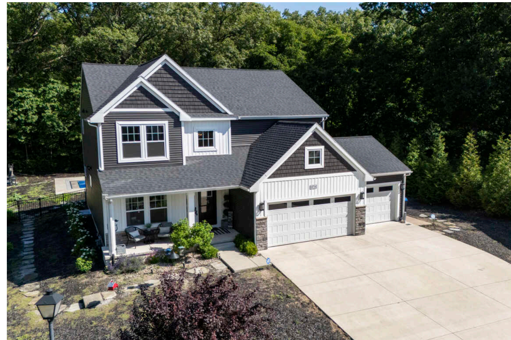
18734 LEONARD COURT • THE SANCTUARY - NEW BUFFALO

@properties | CHRISTIE'S INTERNATIONAL REAL ESTATE