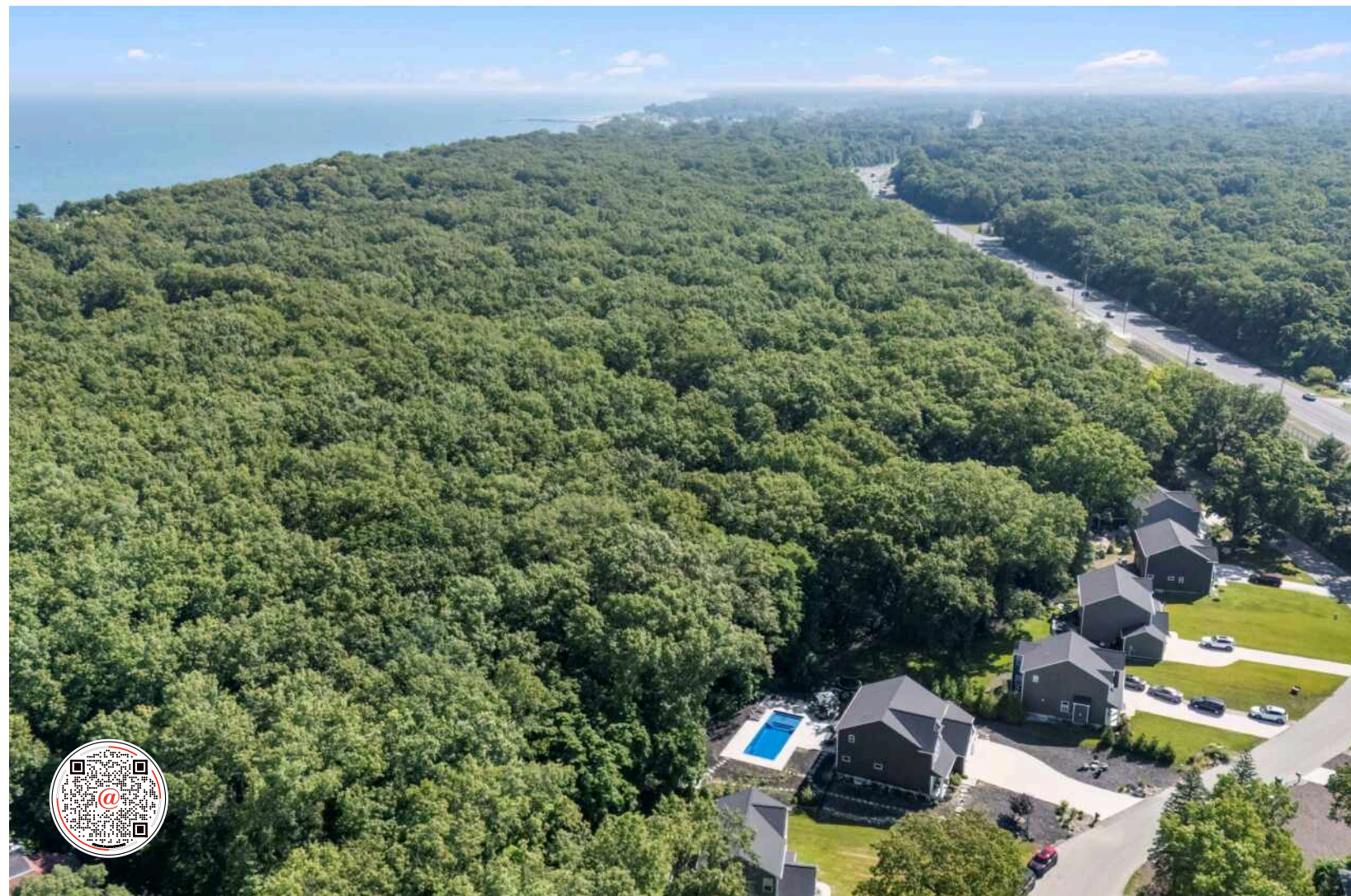
18734 LEONARD COURT THE SANCTUARY - NEW BUFFALO