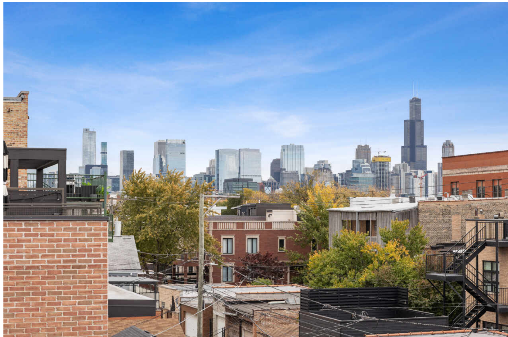
1929 W HURON STREET WEST TOWN