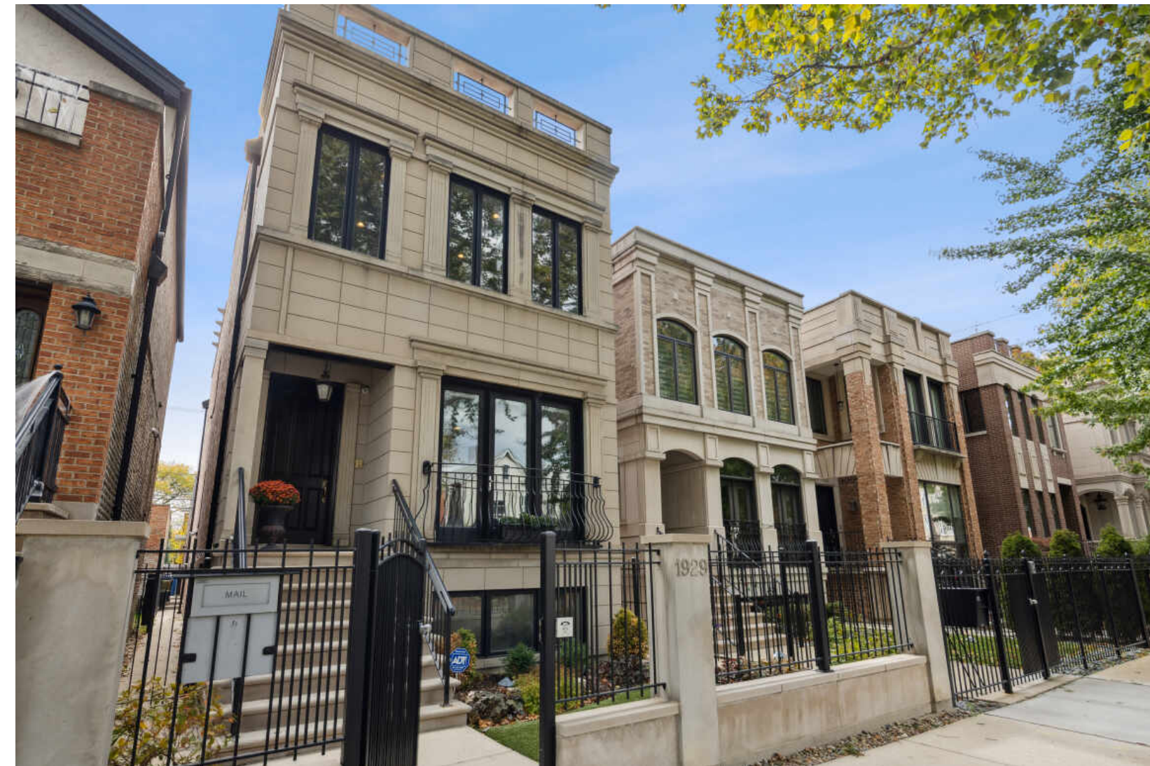
1929 W HURON STREET • WEST TOWN 1929HURON.INFO

@properties | CHRISTIE'S INTERNATIONAL REAL ESTATE