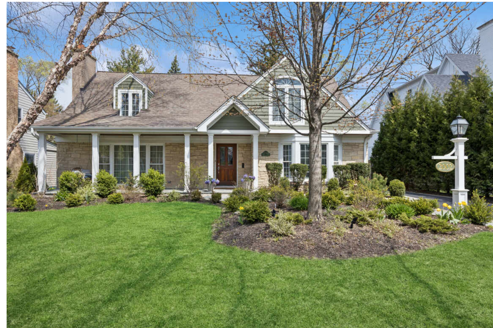
2002 CHESTNUT AVENUE · WILMETTE

@properties | CHRISTIE'S INTERNATIONAL REAL ESTATE