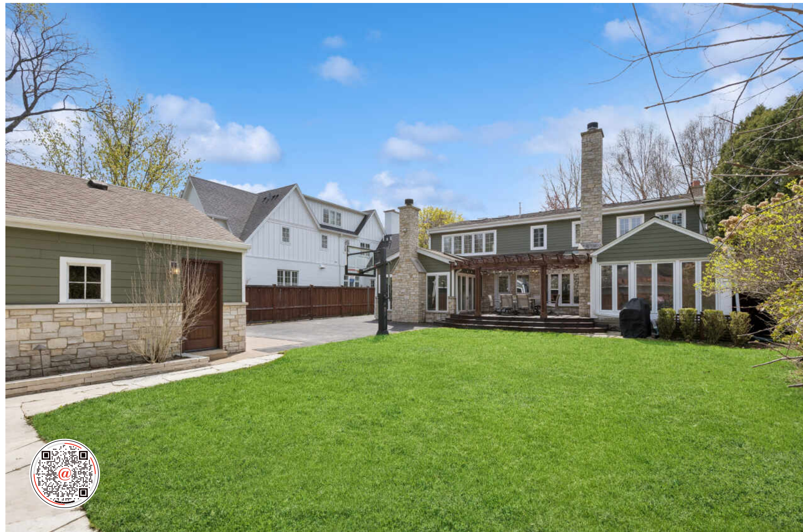
2002 CHESTNUT AVENUE WILMETTE