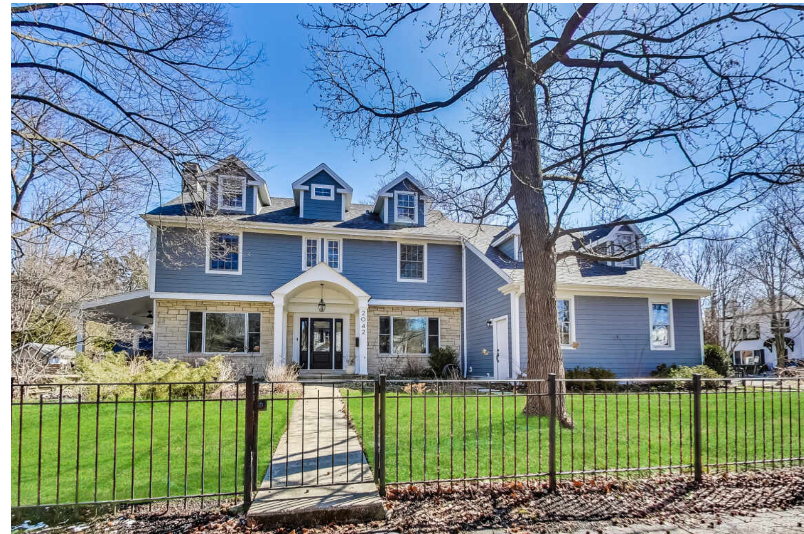
2042 BEECHWOOD AVENUE • WILMETTE 2042BEECHWOOD.INFO

@properties | CHRISTIE'S INTERNATIONAL REAL ESTATE