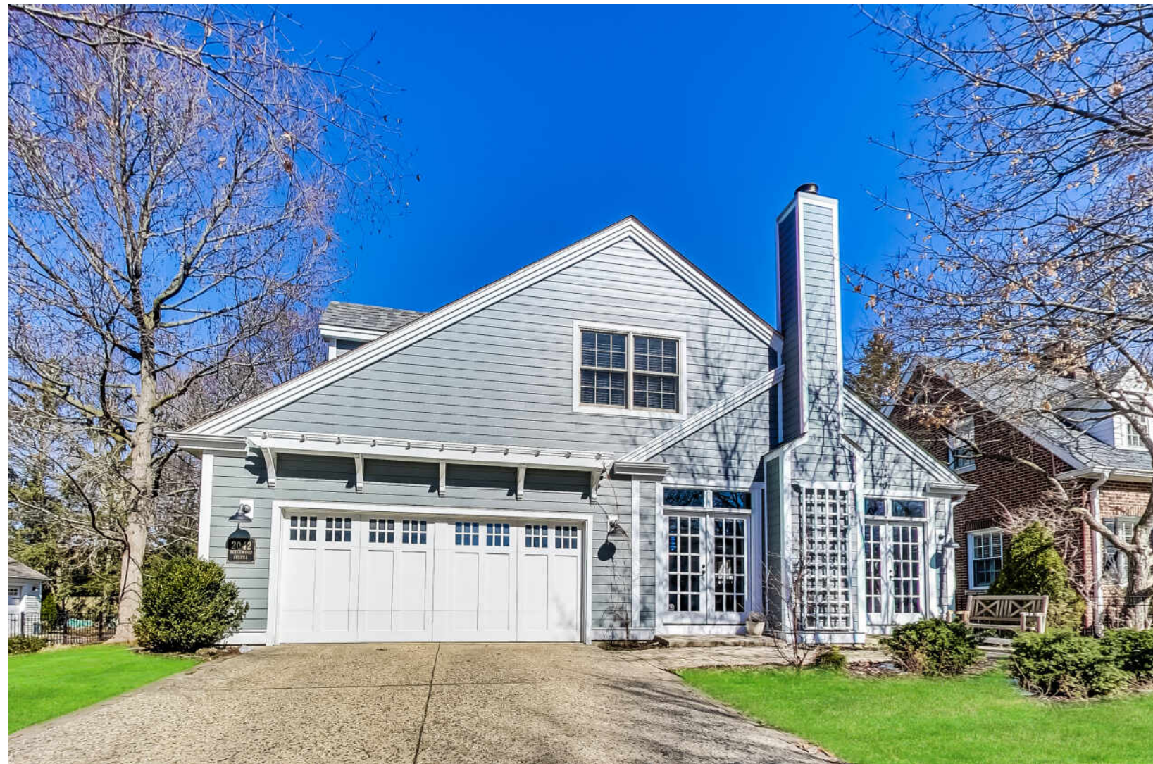
2042 BEECHWOOD AVENUE WILMETTE