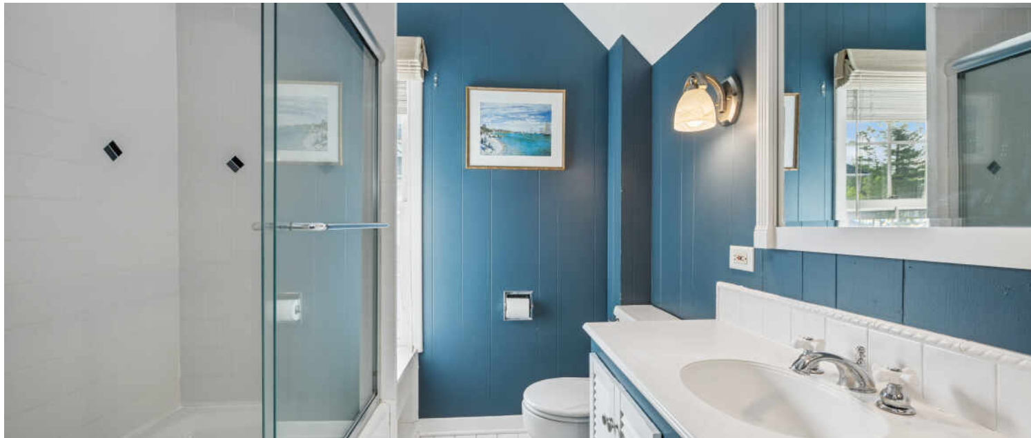
2ND FLOOR HALL BATH