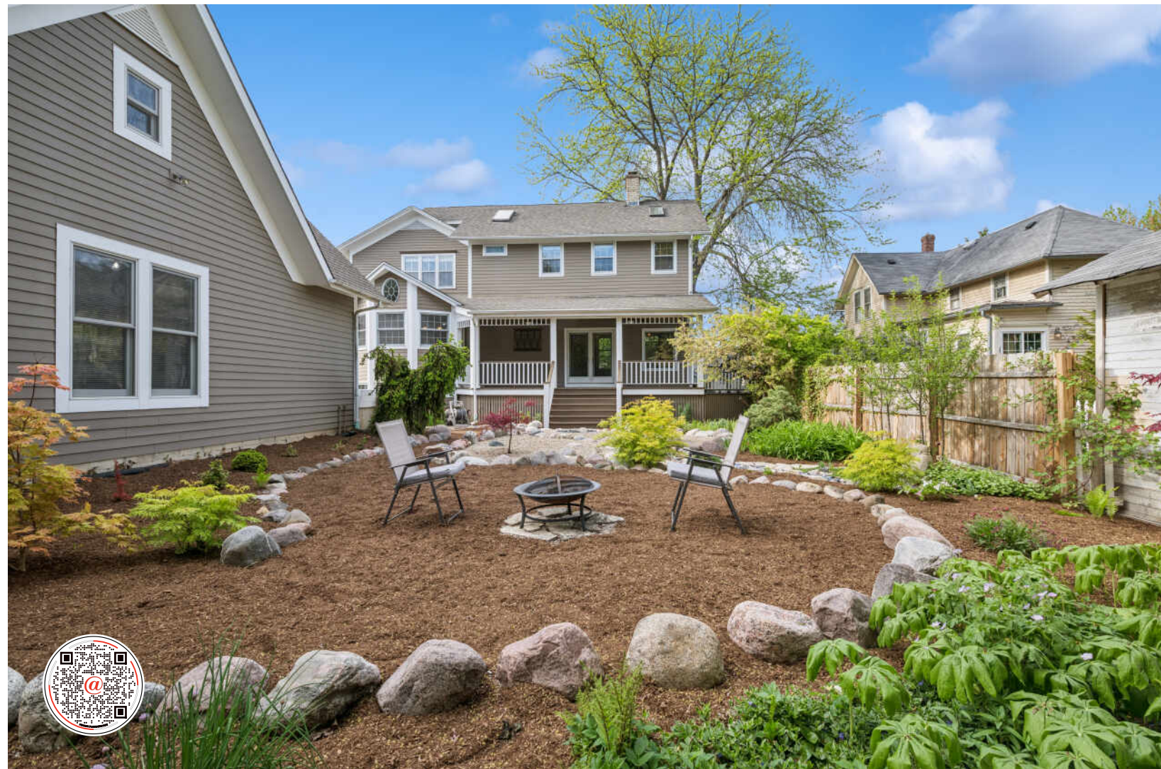
209 W LAKE STREET BARRINGTON VILLAGE