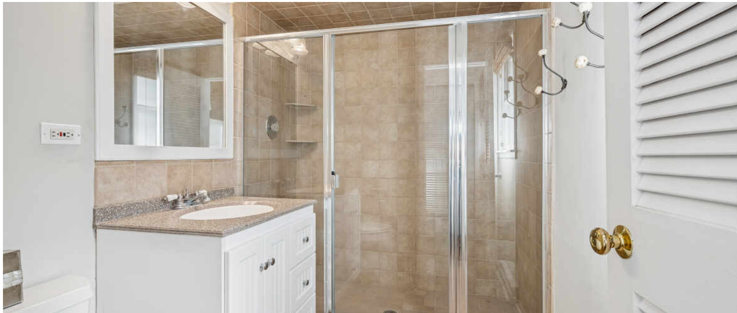
2ND BEDROOM ENSUITE BATH