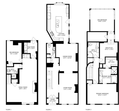
SIZES AND DIMENSIONS ARE APPROXIMATE, ACTUAL MAY VARY