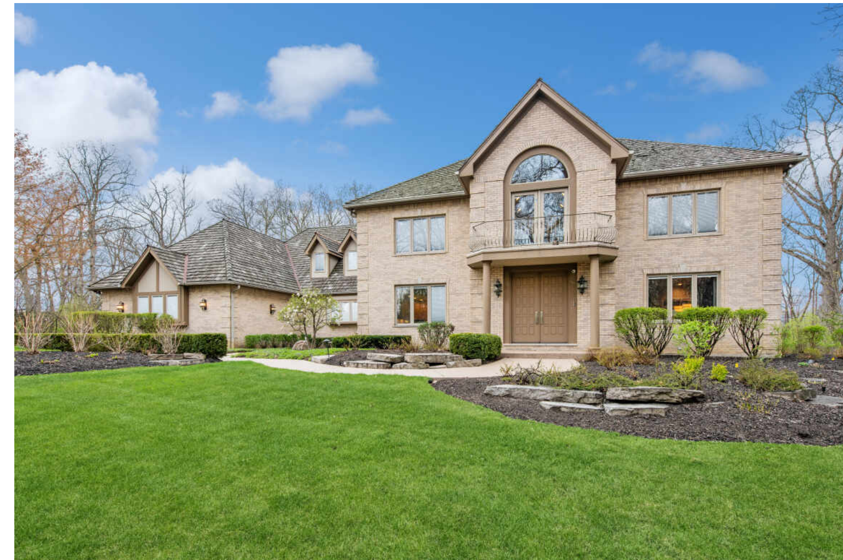
21249 W ANDOVER DRIVE • MUNDELEIN 21249ANDOVER.INFO

@properties | CHRISTIE'S INTERNATIONAL REAL ESTATE