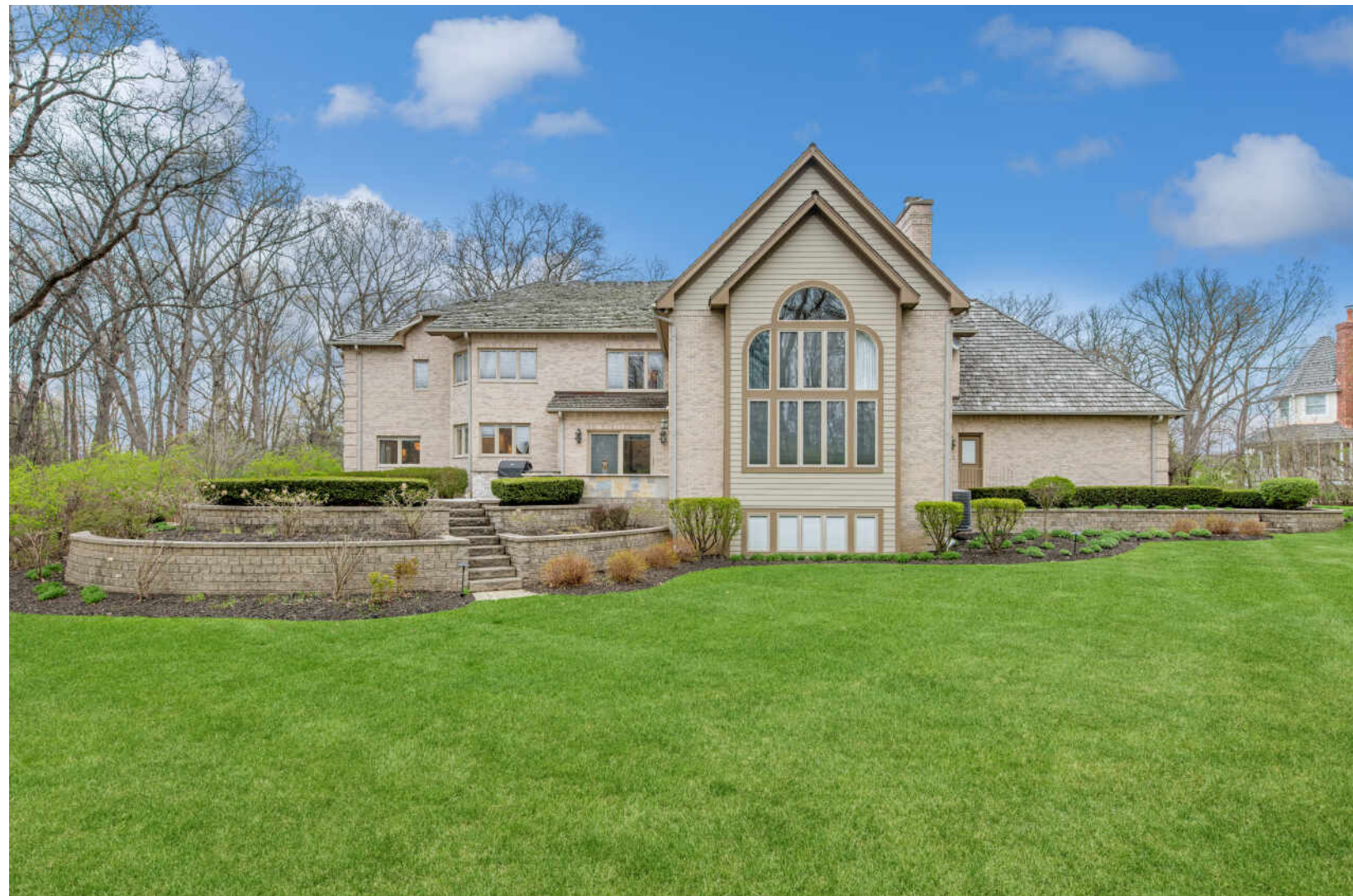
21249 W ANDOVER DRIVE MUNDELEIN