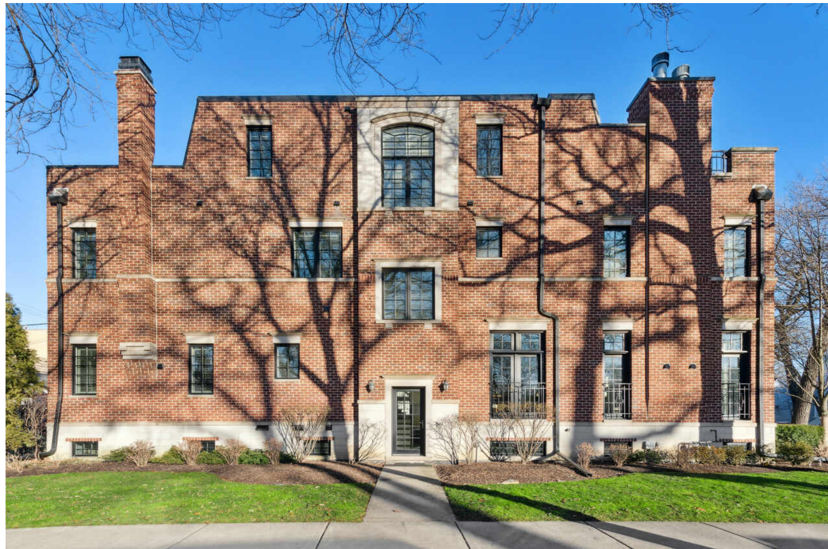
2133 HARRISON ST. EVANSTON

2133 HARRISON ST. • EVANSTON 2133HARRISON.INFO