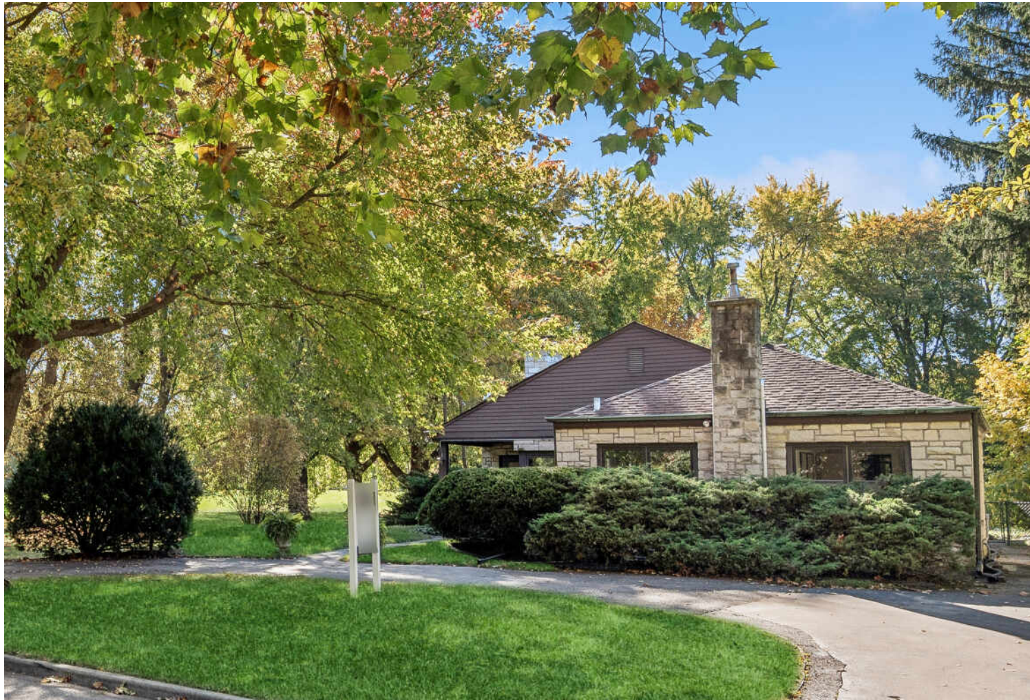
SEMI-CIRCULAR DRIVEWAY AND END OF LANE