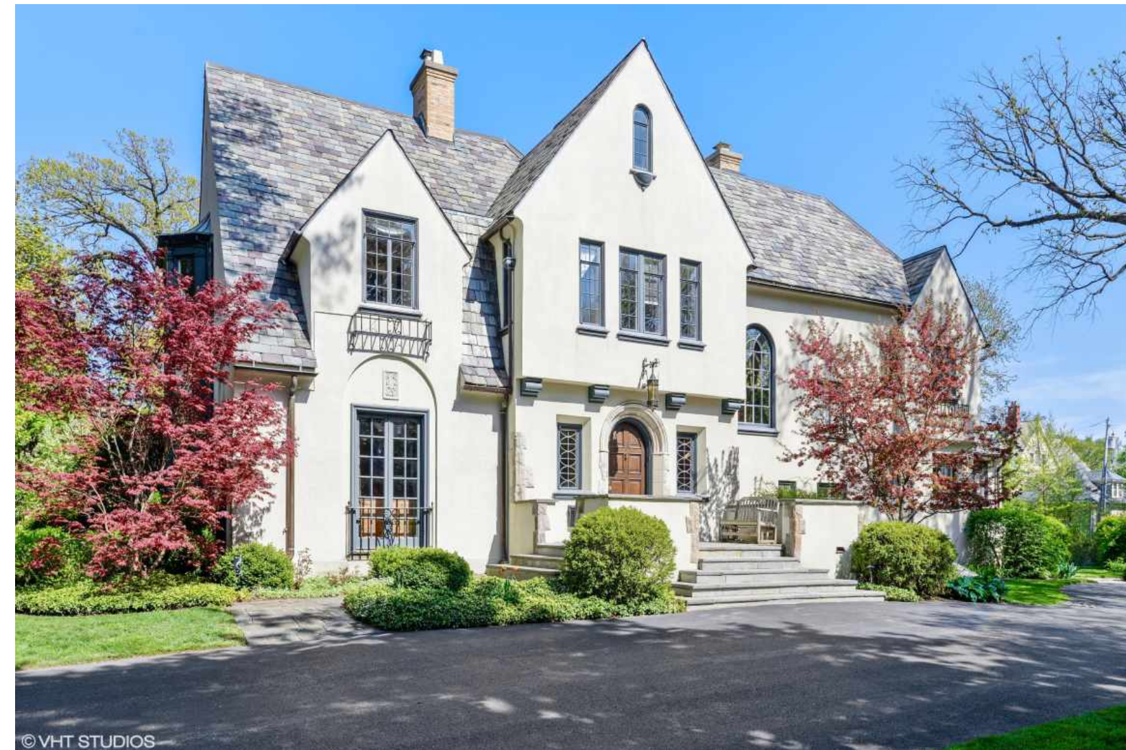
228 GREENWOOD STREET EVANSTON