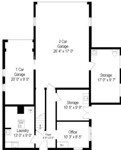
First Level (Coach House)