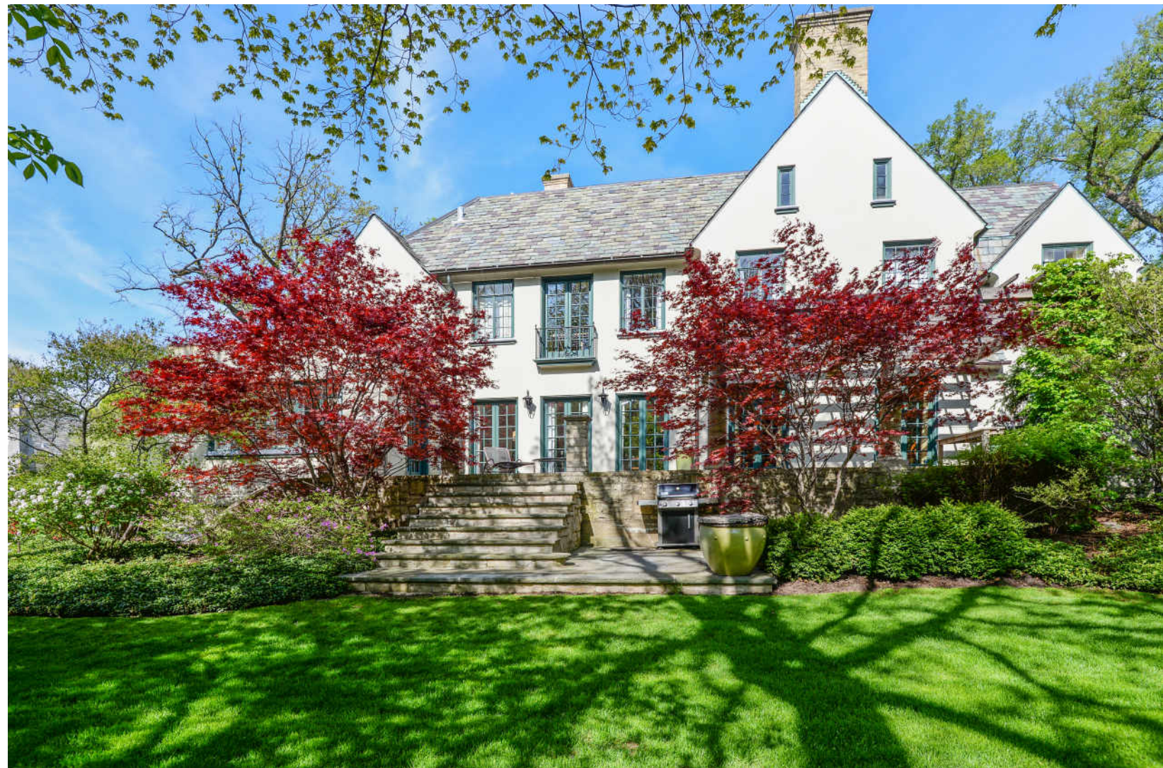
228 GREENWOOD STREET EVANSTON