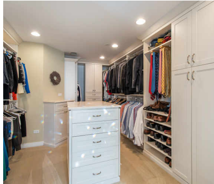
MASTER BEDROOM CLOSET