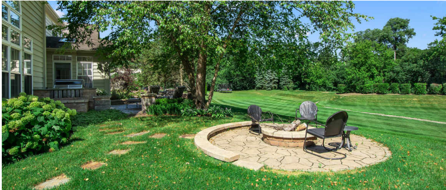
FIRE PIT / REAR YARD