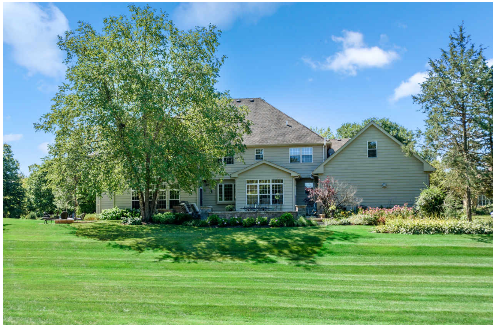
230 CARRIAGE TRAIL BARRINGTON