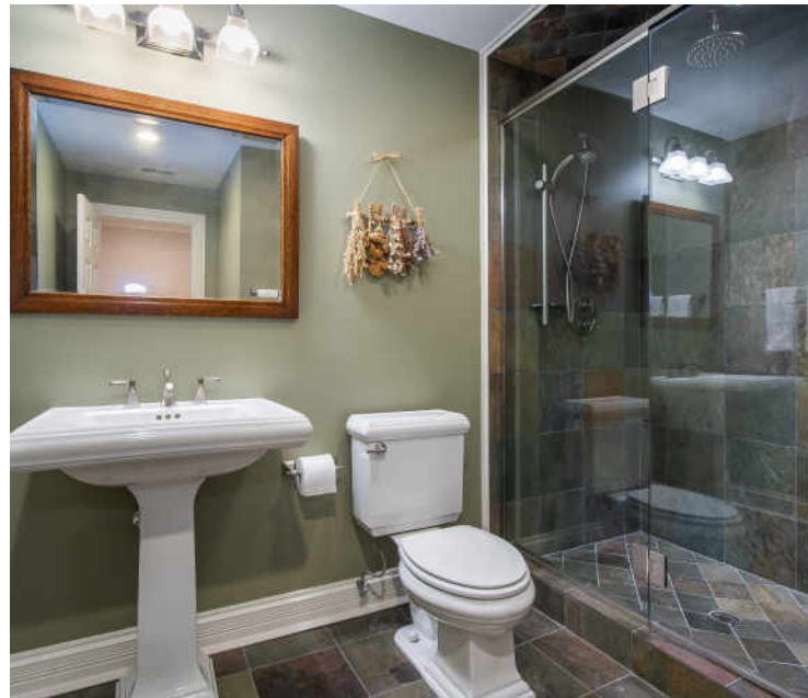
FINISHED LOWER LEVEL FULL BATH