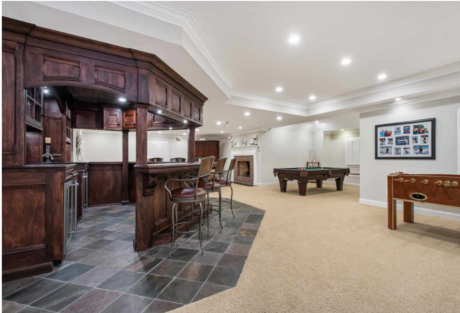
FINISHED LOWER LEVEL