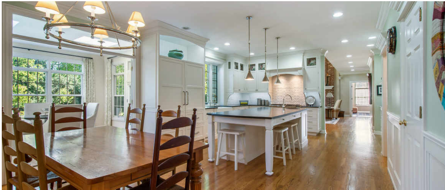
KITCHEN / BREAKFAST ROOM