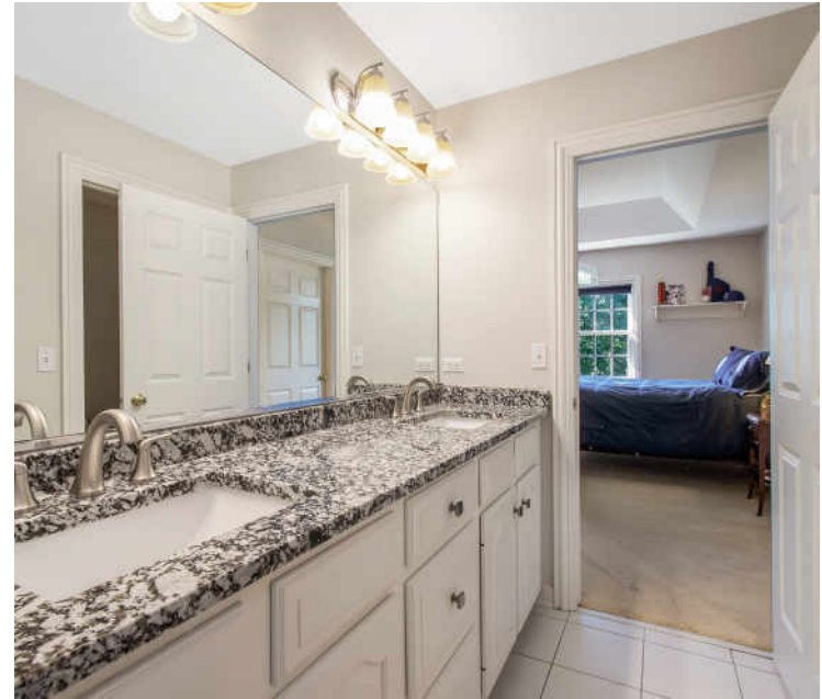
2ND BEDROOM EN-SUITE BATH