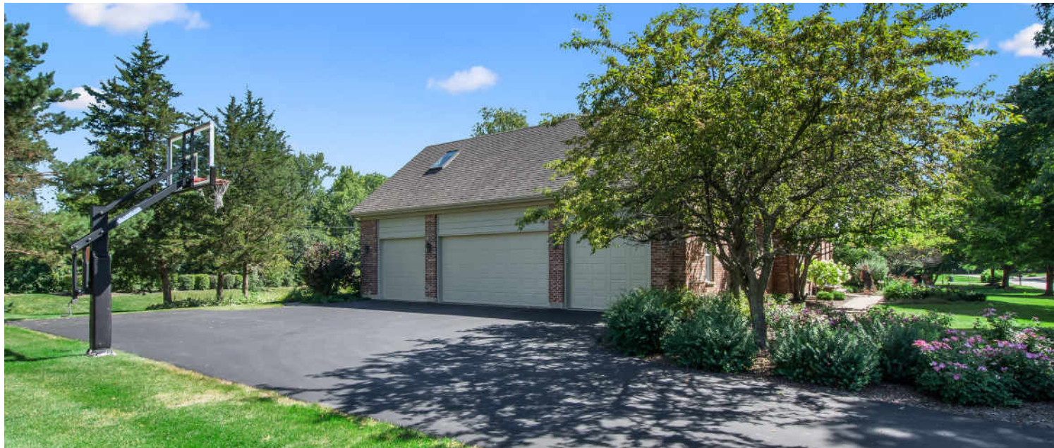
SIDE LOAD 4-CAR GARAGE