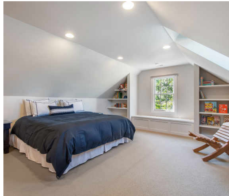
5TH BEDROOM / BONUS ROOM