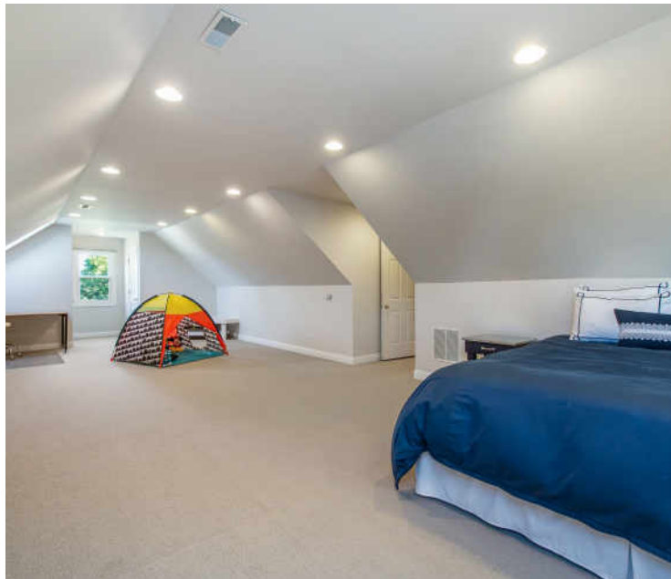
5TH BEDROOM / BONUS ROOM