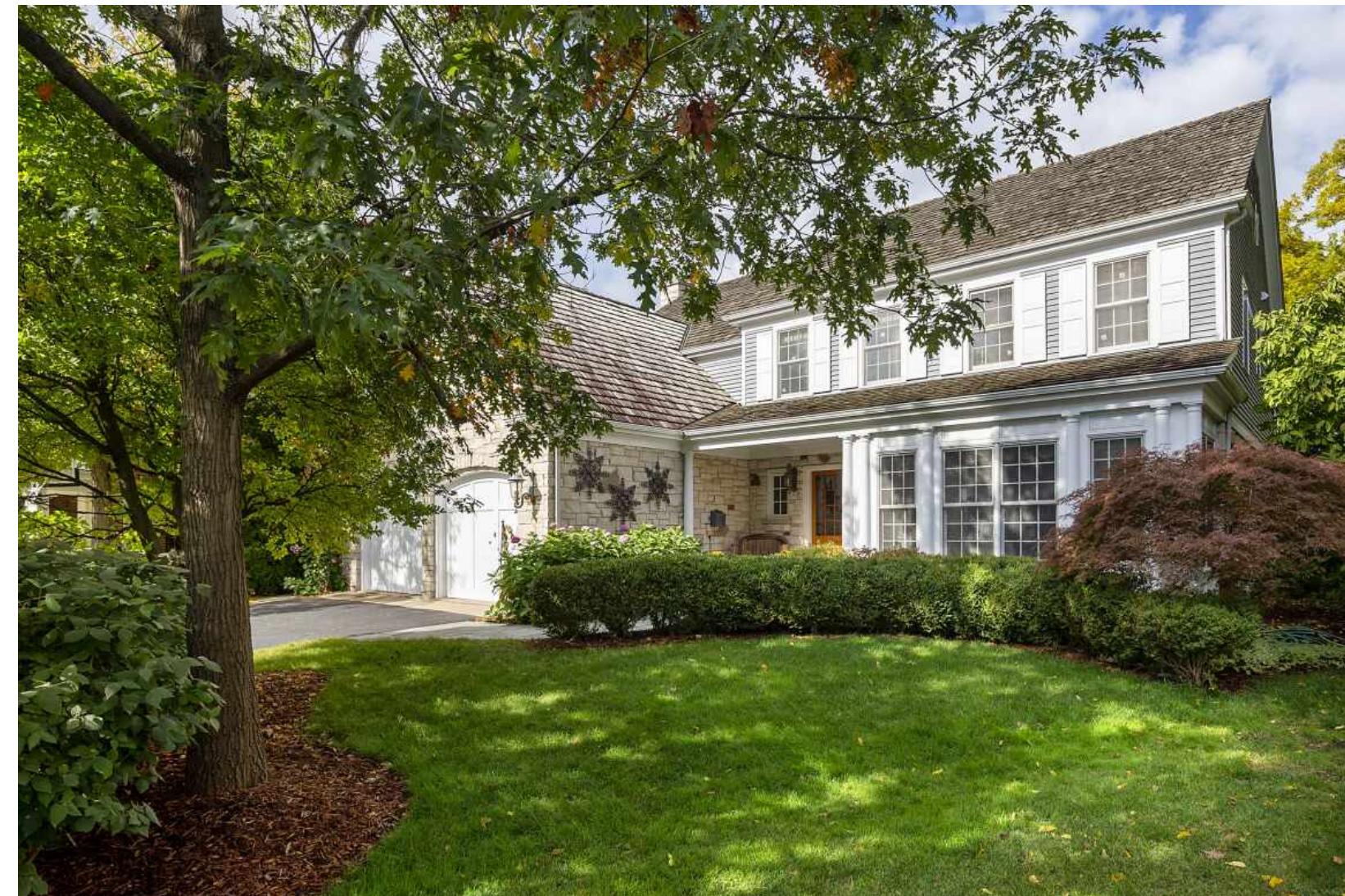
2369 LARKDALE DRIVE · GLENVIEW

@properties | CHRISTIE'S INTERNATIONAL REAL ESTATE