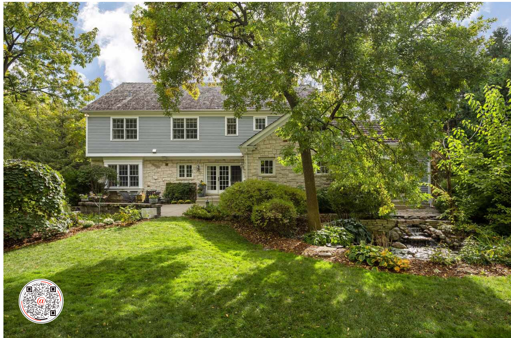
2369 LARKDALE DRIVE GLENVIEW