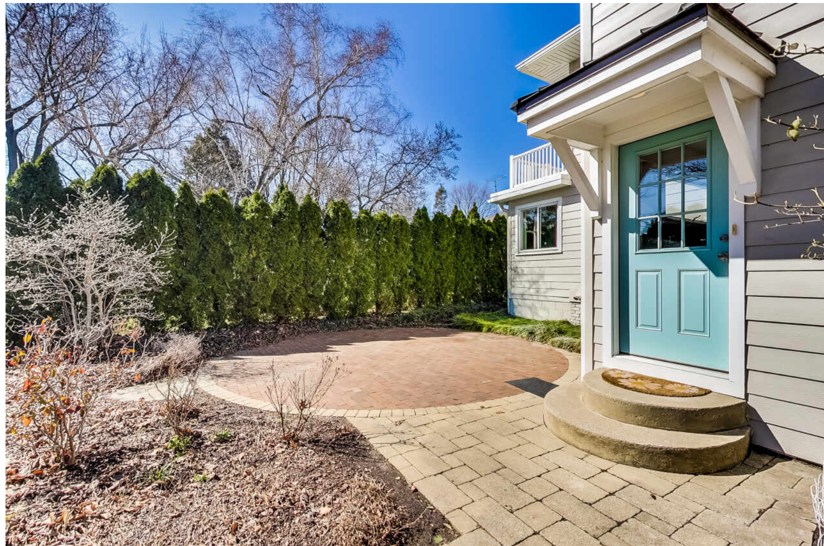
2401 OLD LAKE SHORE ROAD ST. JOSEPH

2401OLDLAKESHOREROAD.INFO 2401 OLD LAKE SHORE ROAD • ST. JOSEPH