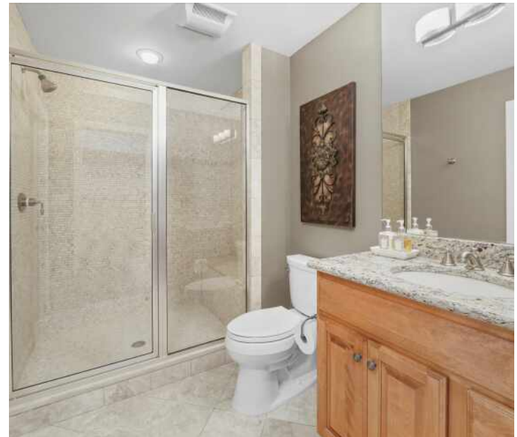
3RD BEDROOM EN-SUITE BATH