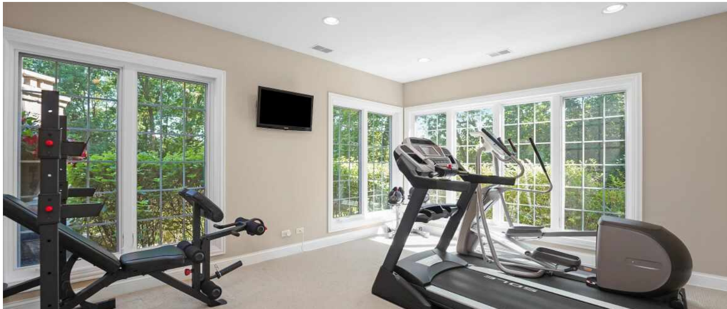
WALK-OUT LOWER LEVEL FITNESS ROOM