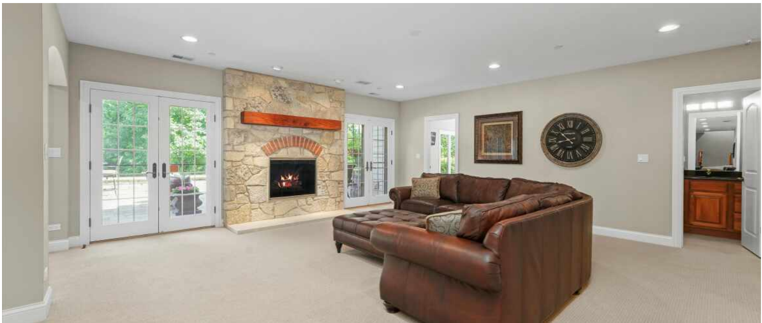
WALK-OUT LOWER LEVEL FAMILY ROOM