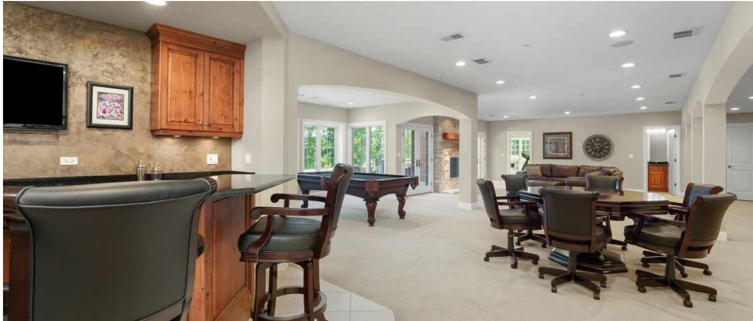
WALK-OUT LOWER LEVEL RECREATION ROOM