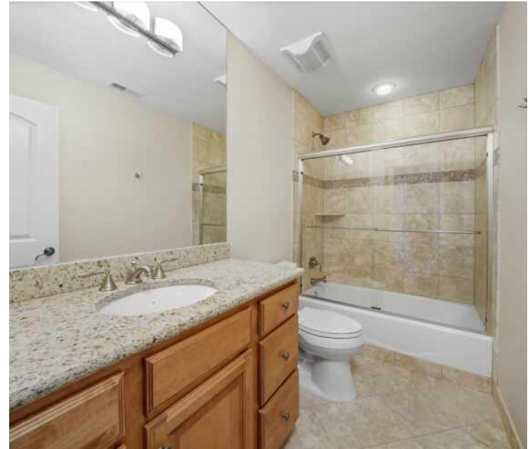
2ND BEDROOM EN-SUITE BATH