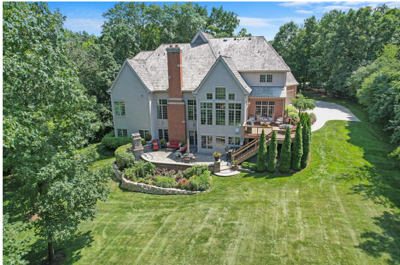
25172 N PAWNEE ROAD BARRINGTON