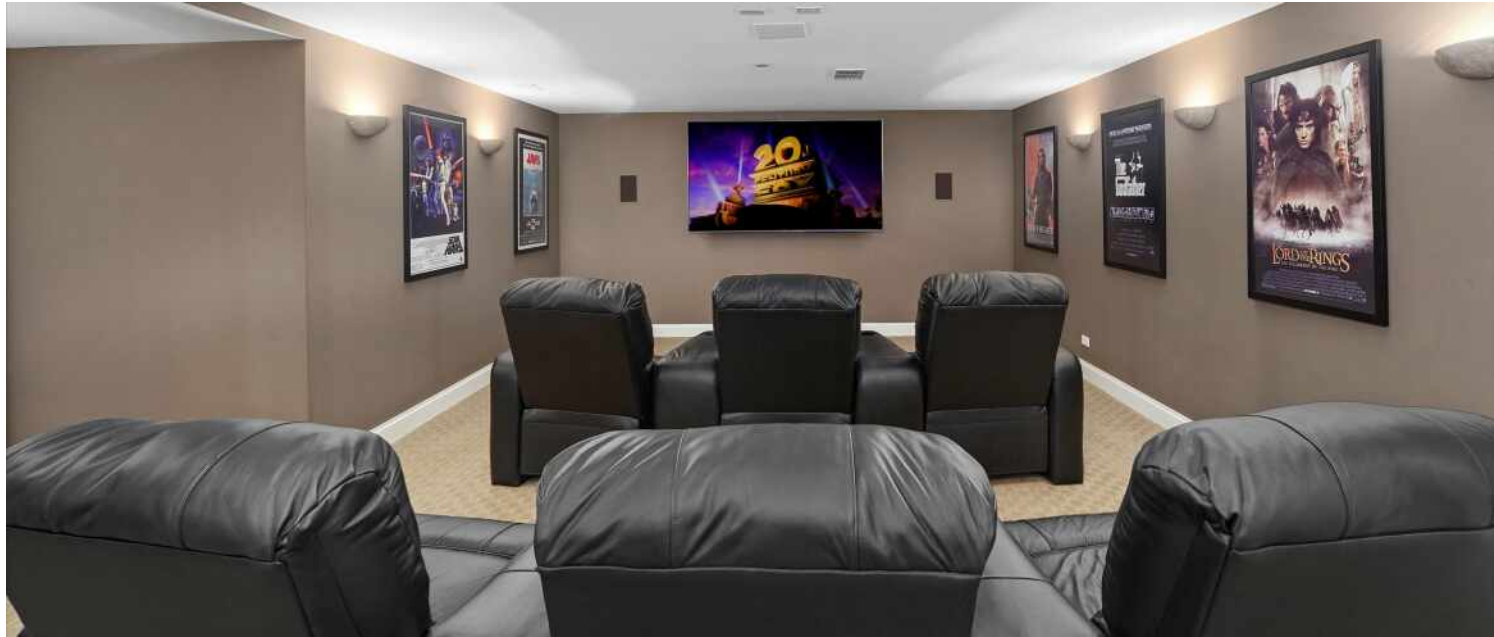
WALK-OUT LOWER LEVEL THEATER