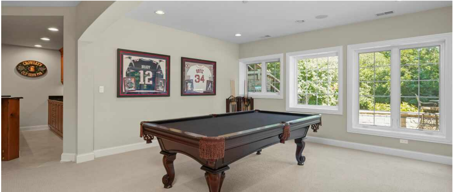
WALK-OUT LOWER LEVEL GAME ROOM