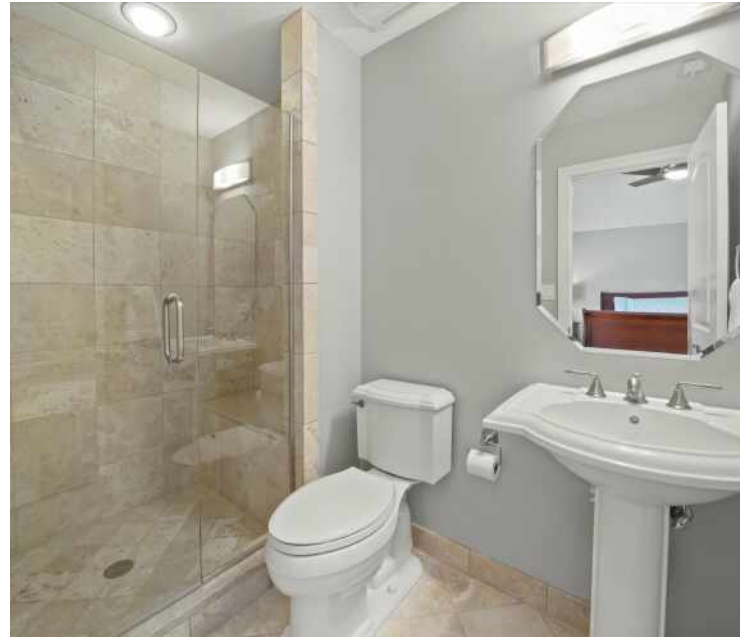
4TH BEDROOM ENSUITE BATH