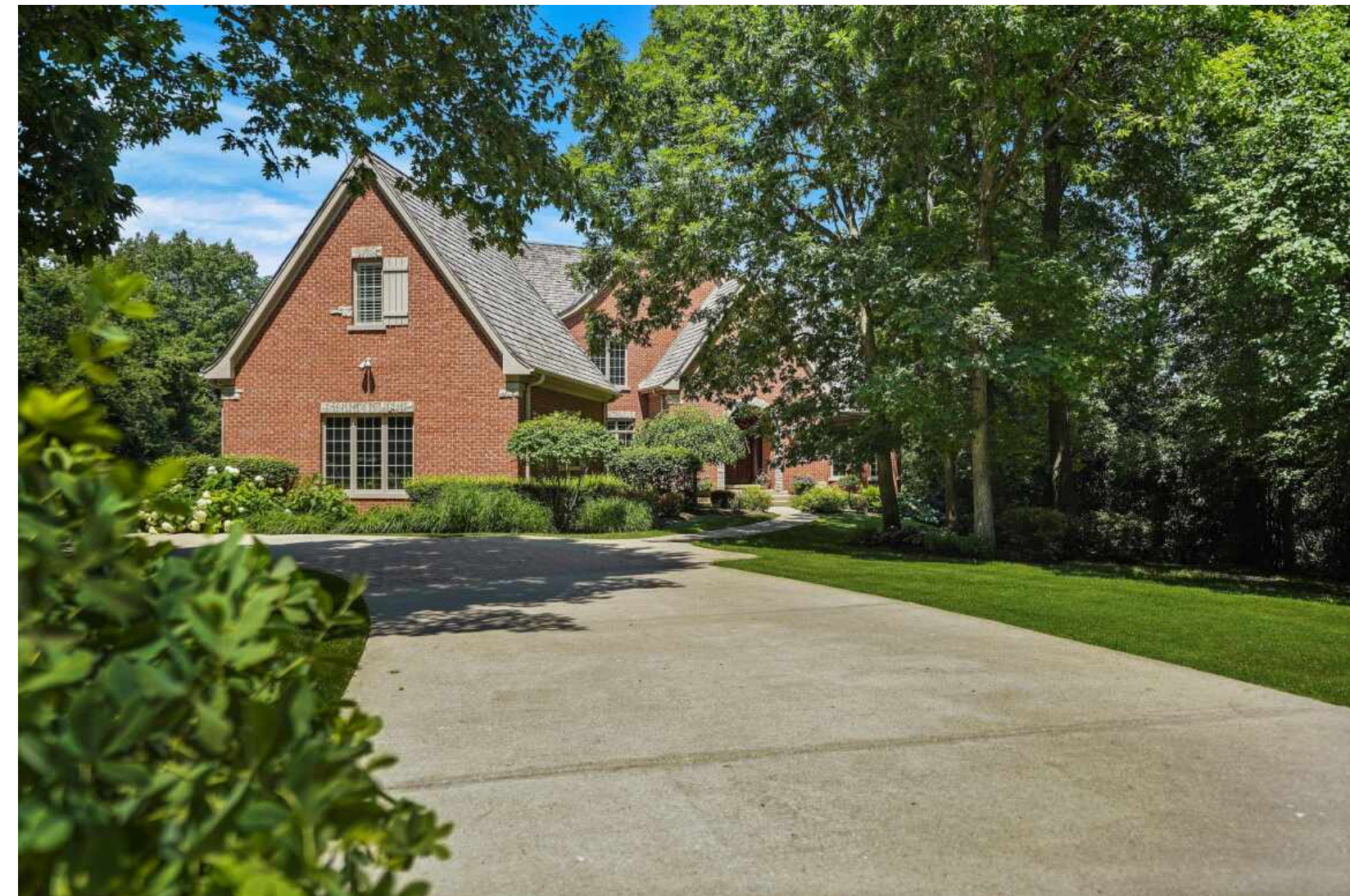
25172 N PAWNEE ROAD • BARRINGTON 25172PAWNEE.INFO

@properties | CHRISTIE'S INTERNATIONAL REAL ESTATE