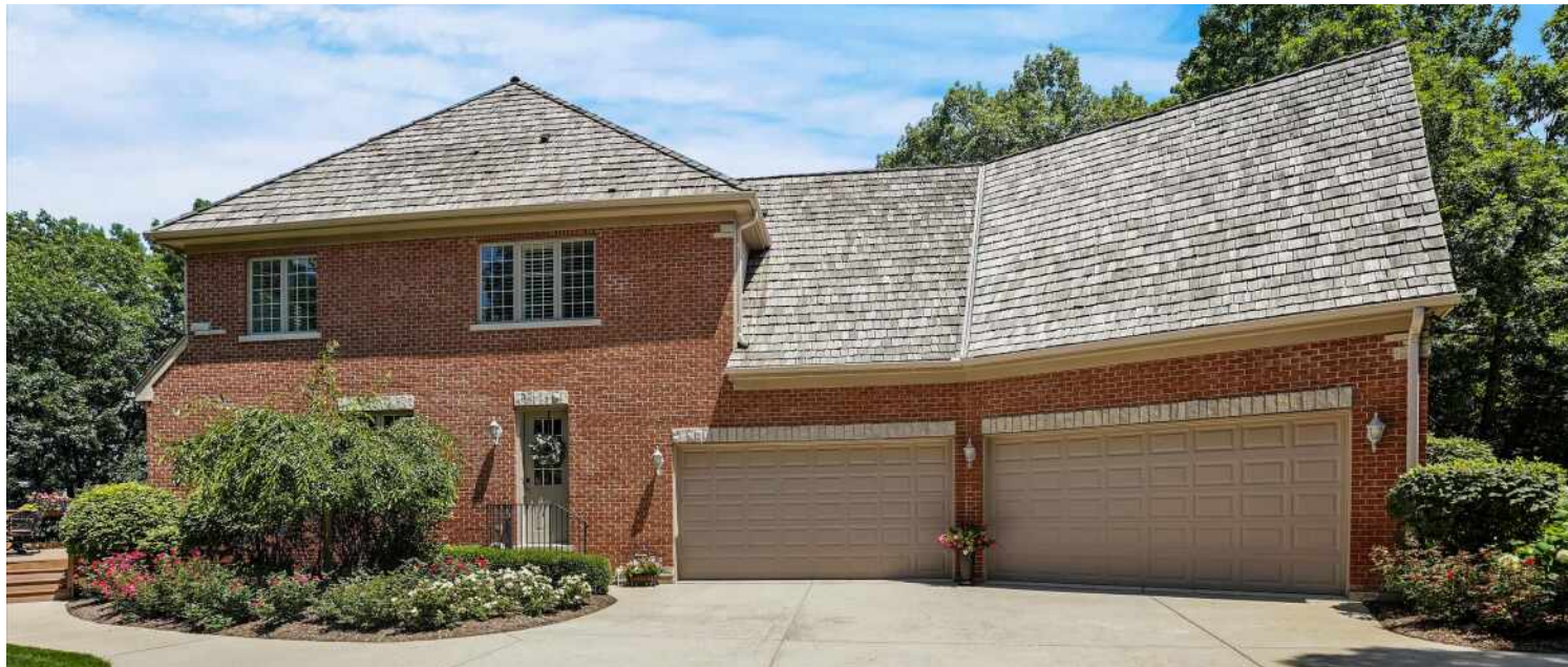
FOUR CAR SIDE LOAD GARAGE