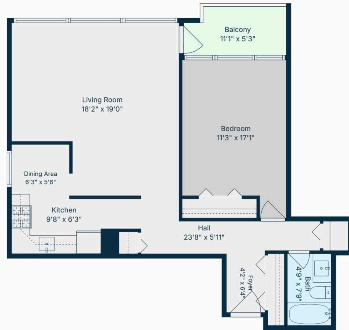
Floor Plan Created By Cubicasa App. Measurements Deemed Highly Reliable But Not Guaranteed.