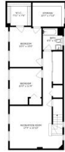
SIZES AND EXPRESSIONS ARE APPROXIMATE, ACTUAL MAY VARY