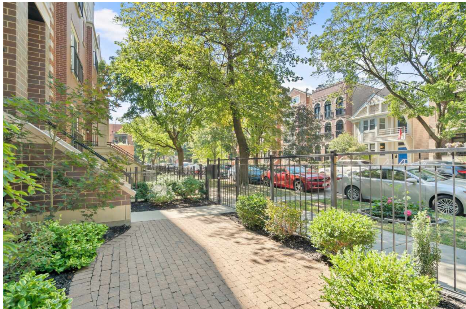
2725 N WAYNE #1 LINCOLN PARK