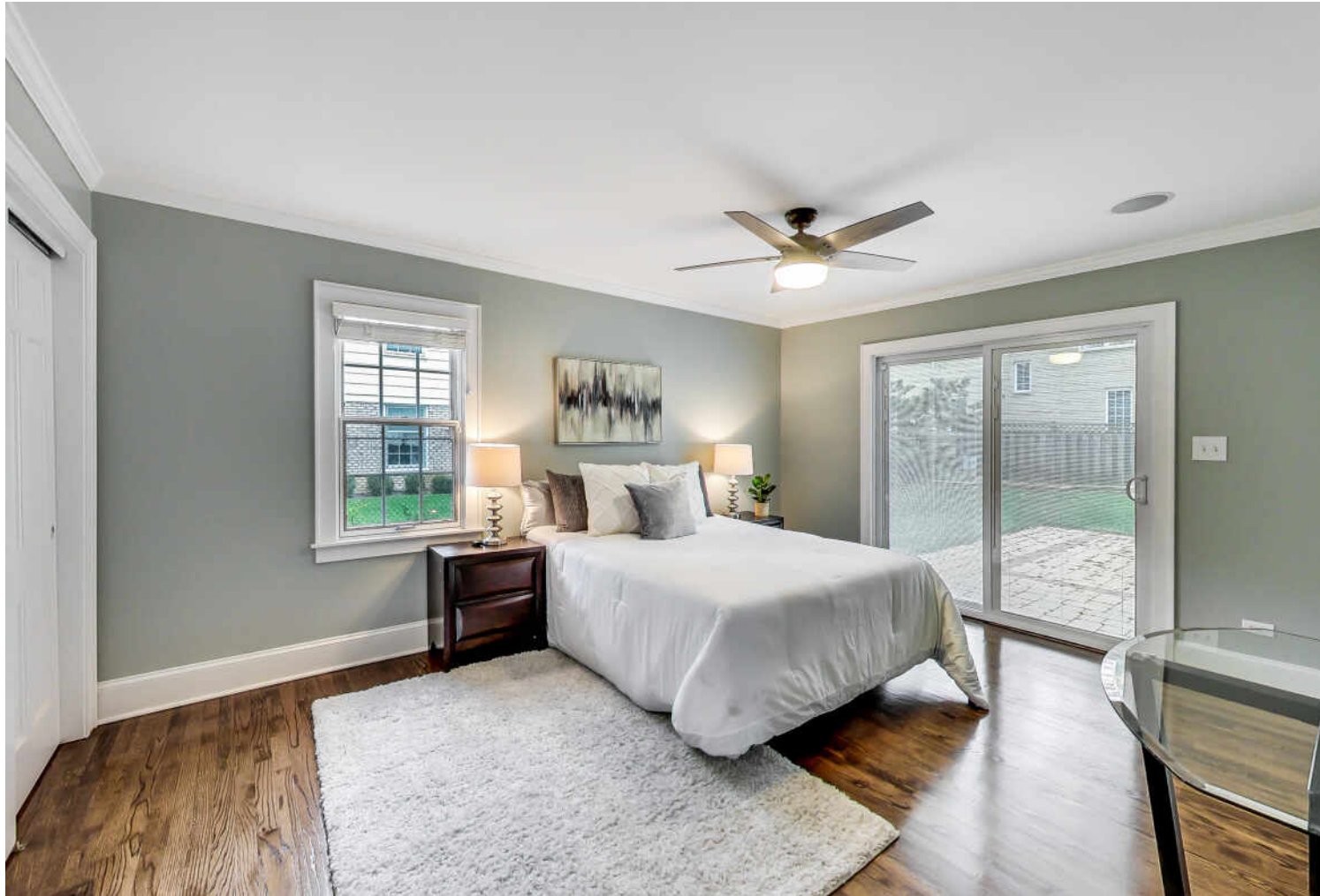
MAIN FLOOR BEDROOM