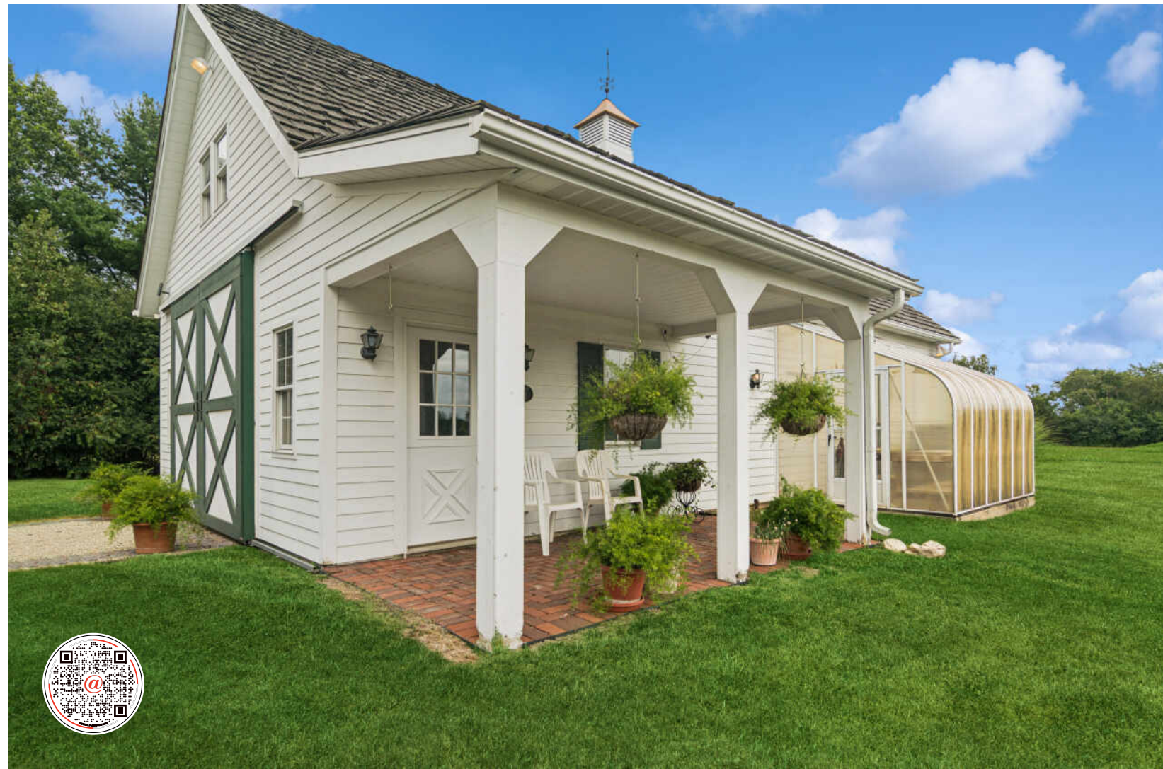
2 HICKORY LANE BARRINGTON HILLS