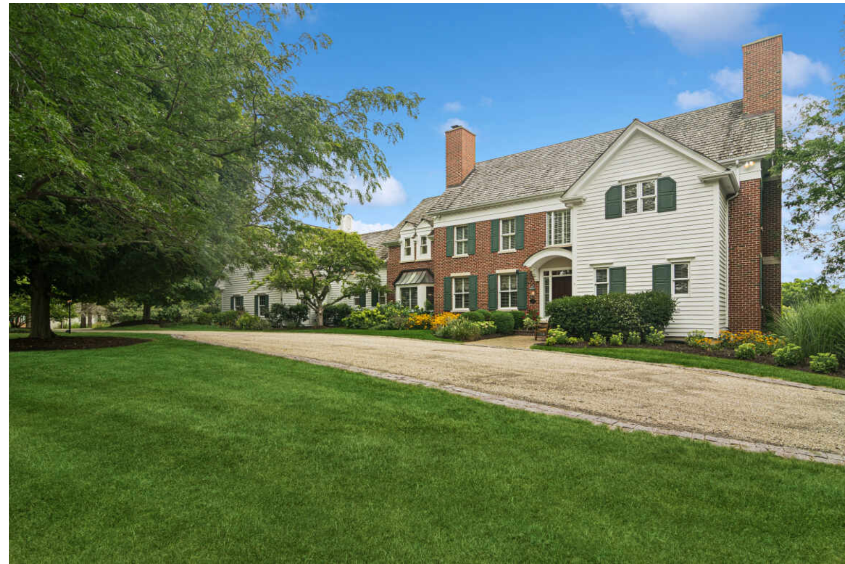
2 HICKORY LANE · BARRINGTON HILLS