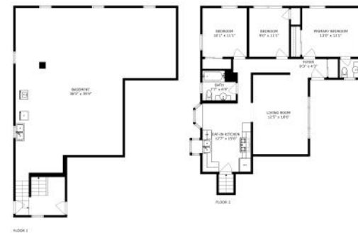
ROOMS AND DIMENSIONS ARE APPROXIMATE. ACTUAL MAY VARY.