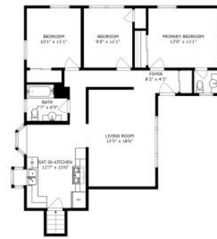
ROOMS AND DIMENSIONS ARE APPROXIMATE. ACTUAL MAY VARY.