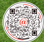
31 E SANDPIPER LANE LAKE FOREST