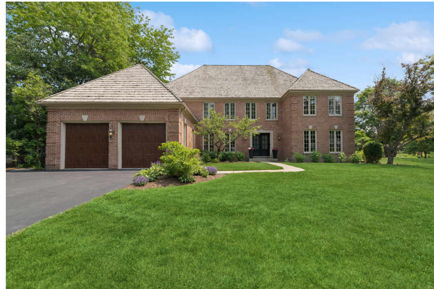
31 E SANDPIPER LANE • LAKE FOREST