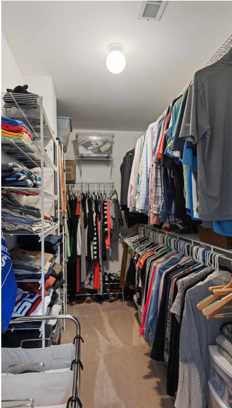
MASTER BEDROOM CLOSET