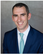
LEIGH MARCUS BROKER

This incredible sun-drenched home boasts an open concept floorplan with 3 generously sized bedrooms up, 2 elegant gas fireplaces and is complemented by exquisite wainscoting, crown molding, newly refinished hardwood flooring and fresh paint throughout! Modern kitchen boasts crisp white cabinetry, premium stone counters, eat-in island and stainless appliances including a beverage refrigerator. Formal family, living, dining and powder rooms on main level. Grand master suite is highlighted by vaulted ceilings with skylights and offers an en suite balcony and expansive walk-in closet. Spa-en suite features dual vanity, Whirlpool and separate shower. W/D on second level for convenience. Lower level rec room complete with print-worthy bar, 4th bedroom, full bathroom, proper laundry room and storage. Detached 2-car garage. Lush front and rear landscapes. Impressive rear deck! Moments to Fellger & Hamlin Park, dining, Target, Mariano's and more!