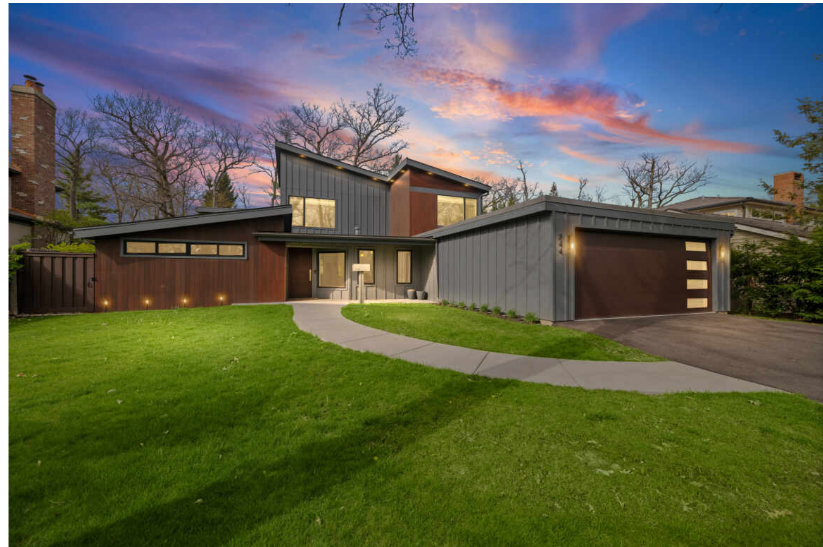
344 EAST WITCHWOOD LANE · LAKE BLUFF

@properties | CHRISTIE'S INTERNATIONAL REAL ESTATE