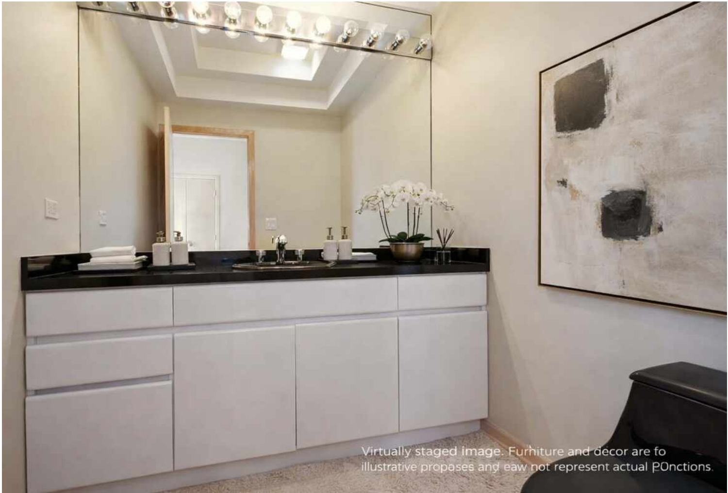
Virtually staged image. Furniture and decor are for illustrative purposes and may not represent actual conditions.