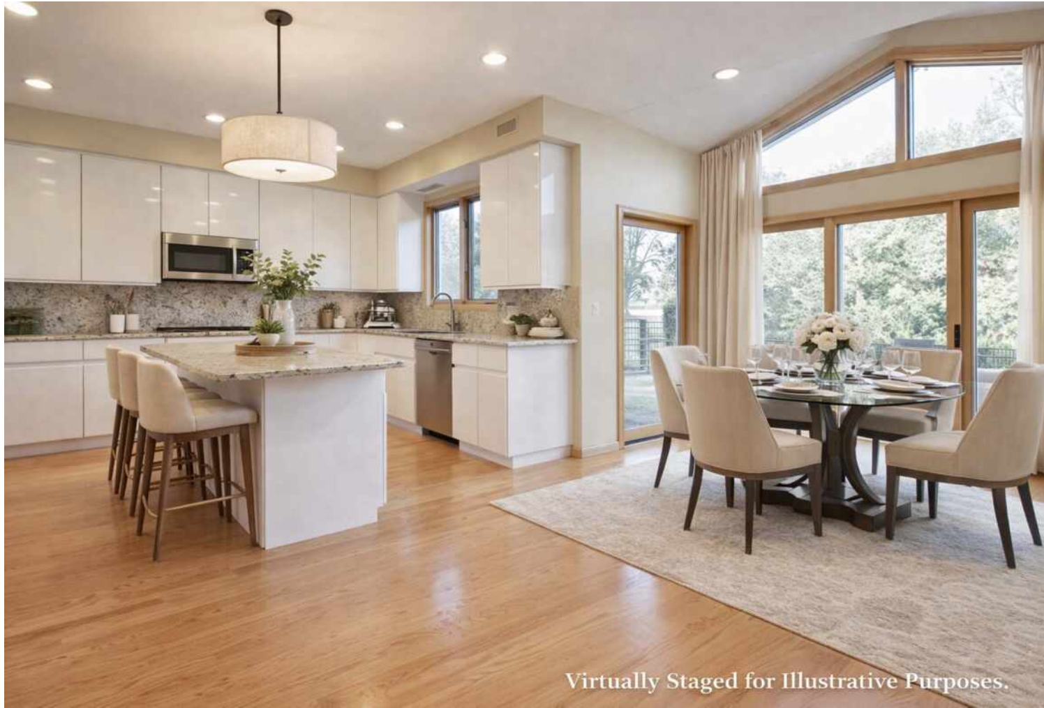
Virtually Staged for Illustrative Purposes.