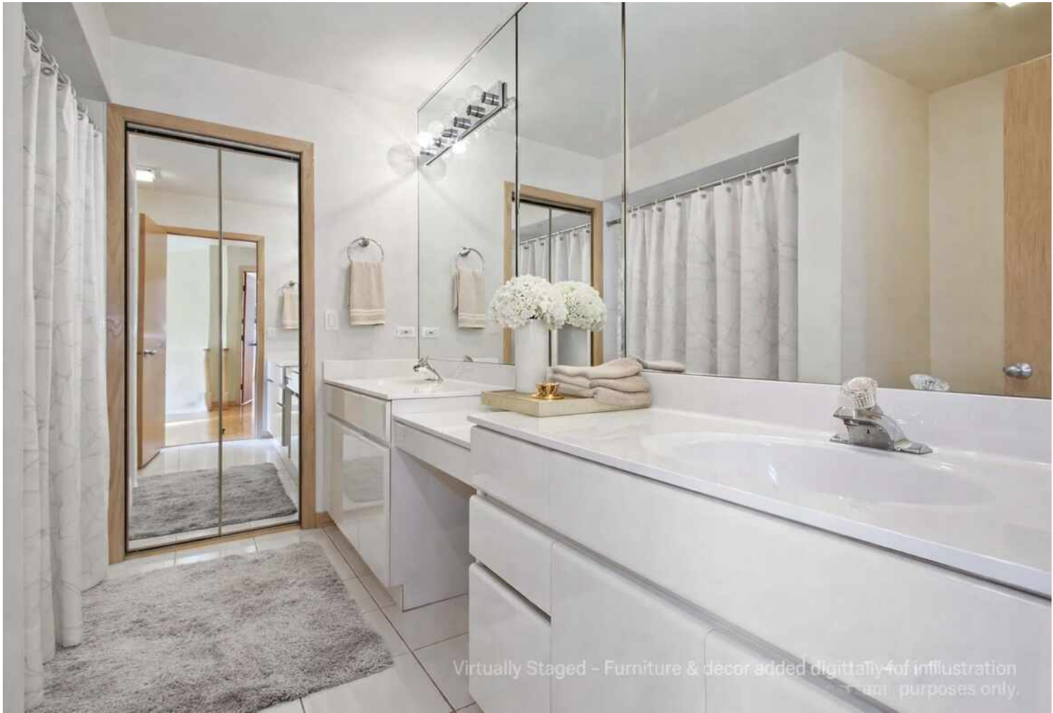
Virtually Staged - Furniture & décor added digitally for illustration purposes only.