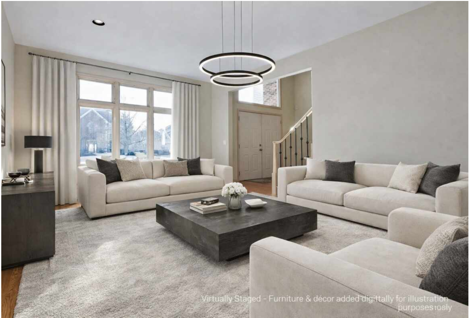
Virtually Staged - Furniture & décor added digitally for illustration purposes only