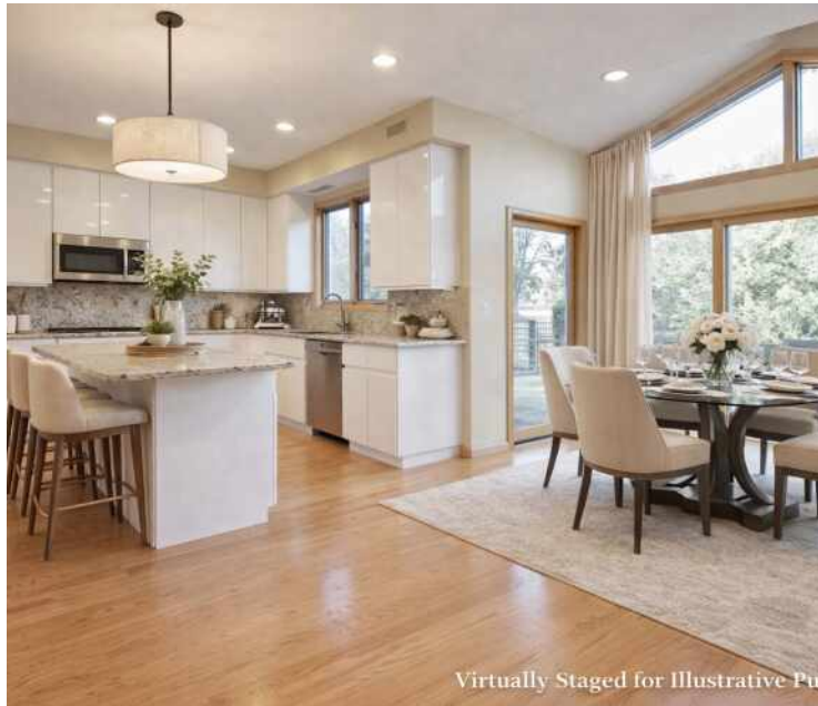
Virtually Staged for Illustrative Purposes