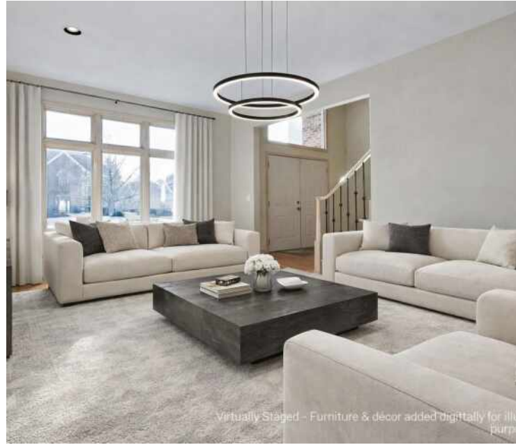
Virtually Staged - Furniture & décor added digitally for illustrative purposes