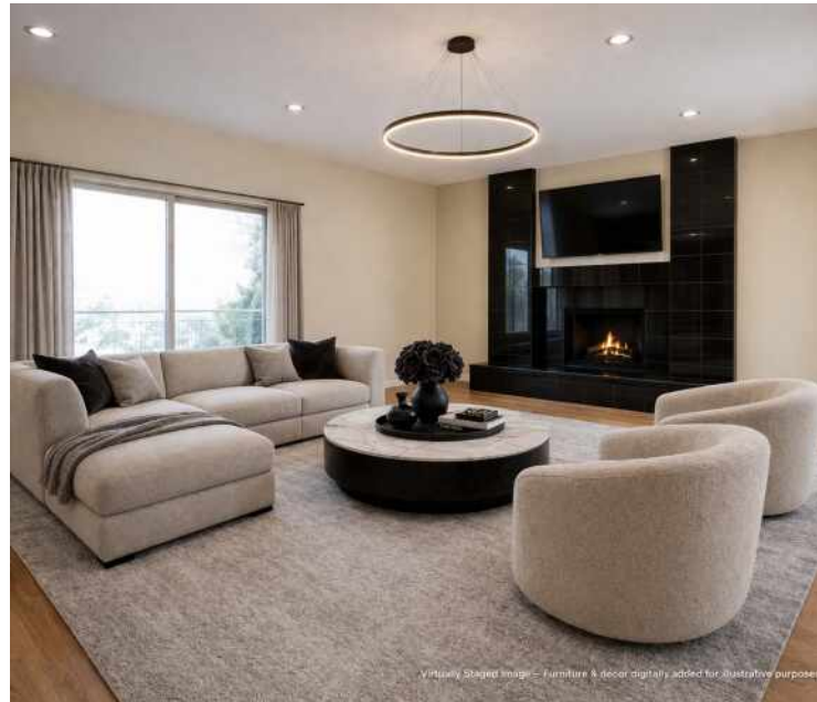
Virtually Staged Image - Furniture & décor digitally added for illustrative purposes