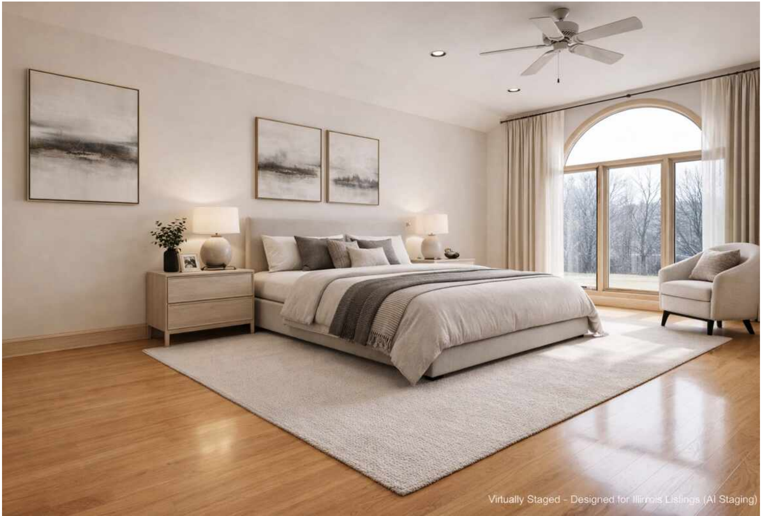
Virtually Staged - Designed for Illinois Listings (AI Staging)