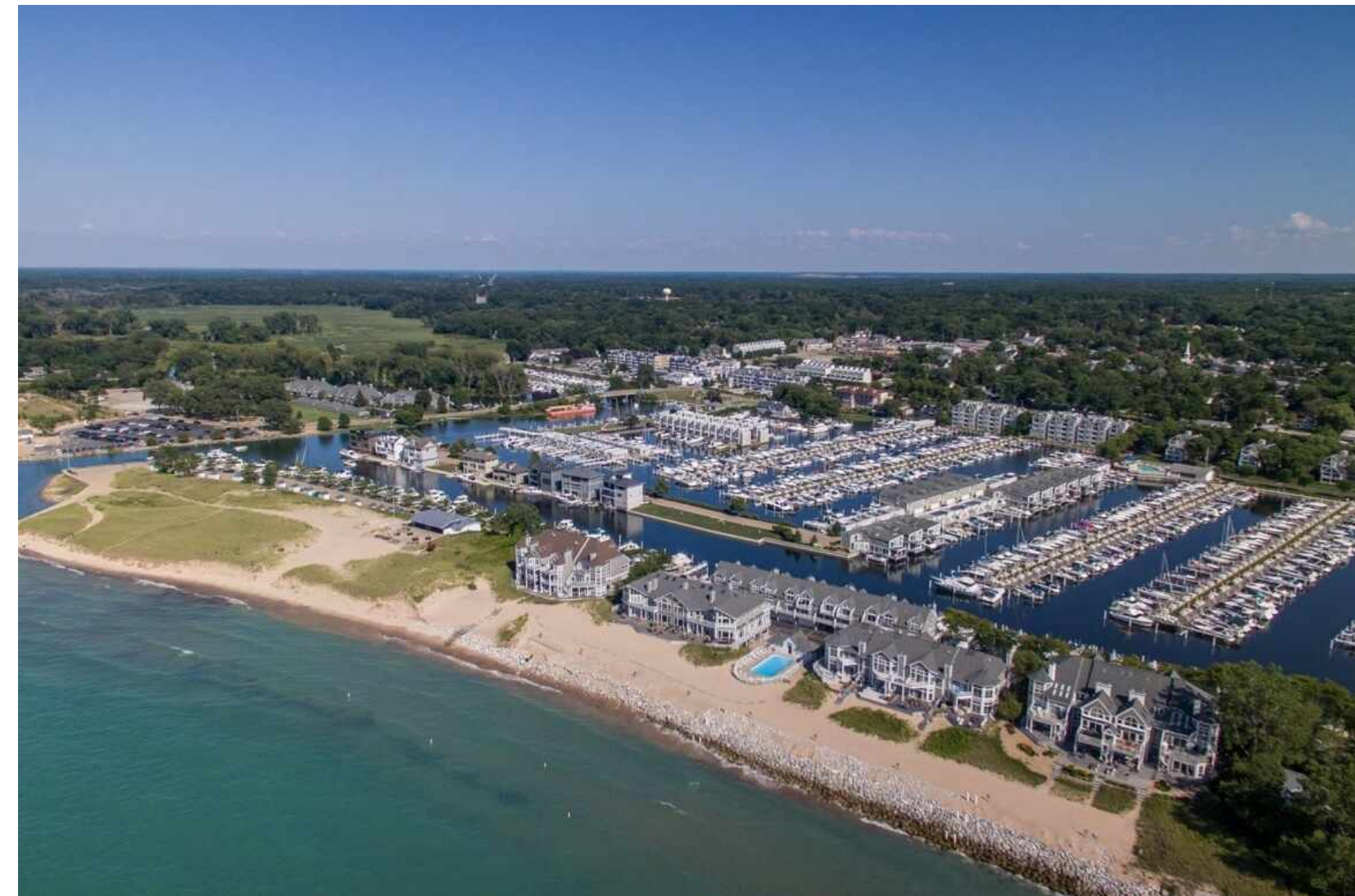
409 LAKE DRIVE UNIT 11 • DUNEWOOD: NEW BUFFALO 409LAKE DRIVE UNIT 11.INFO

@properties | CHRISTIE'S INTERNATIONAL REAL ESTATE