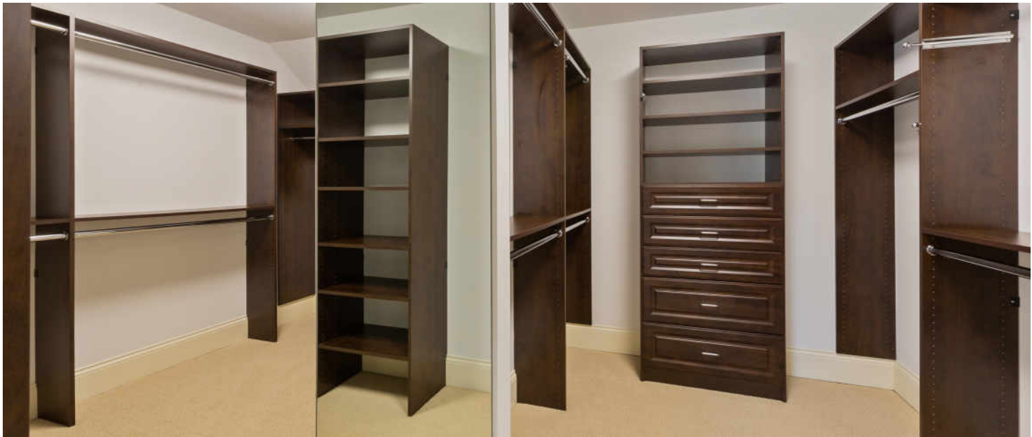
MASTER BEDROOM CLOSET