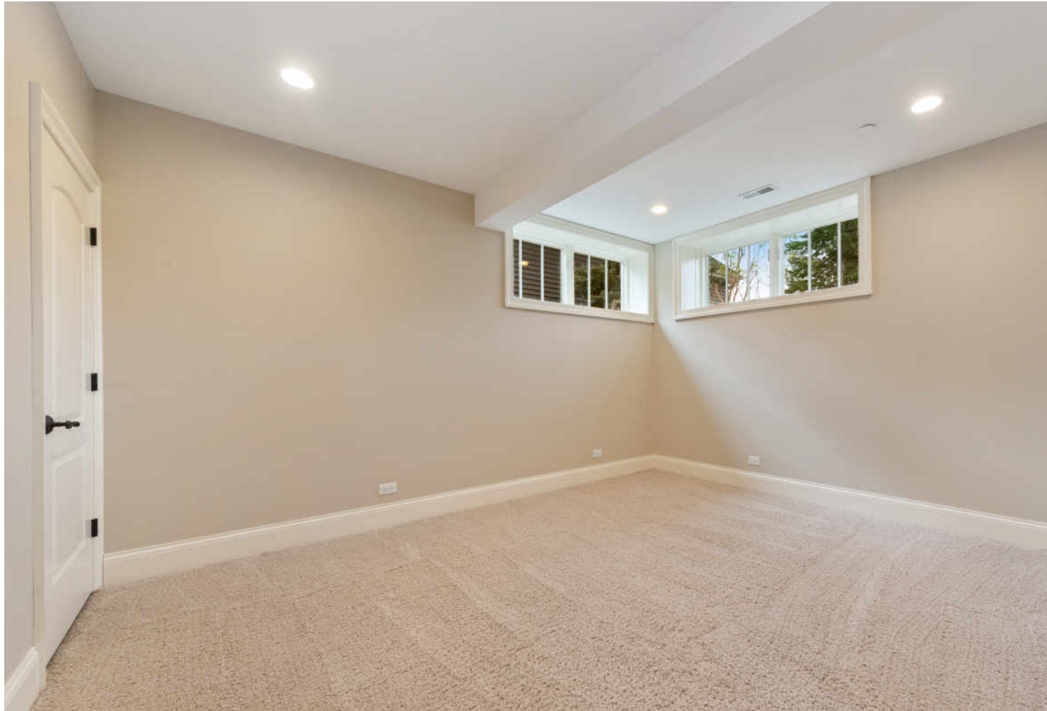
LOWER LEVEL BEDROOM