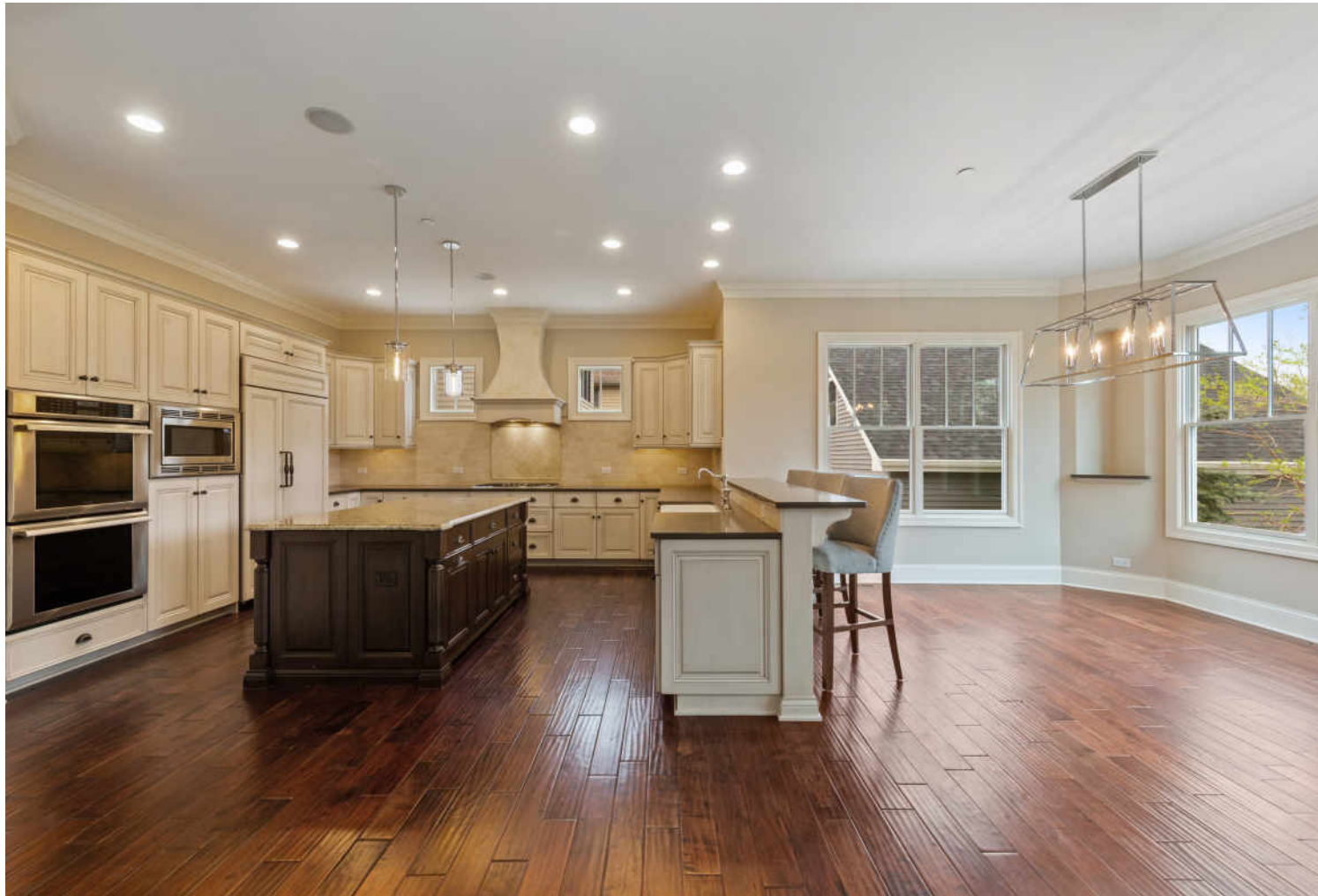
KITCHEN & BREAKFAST NOOK