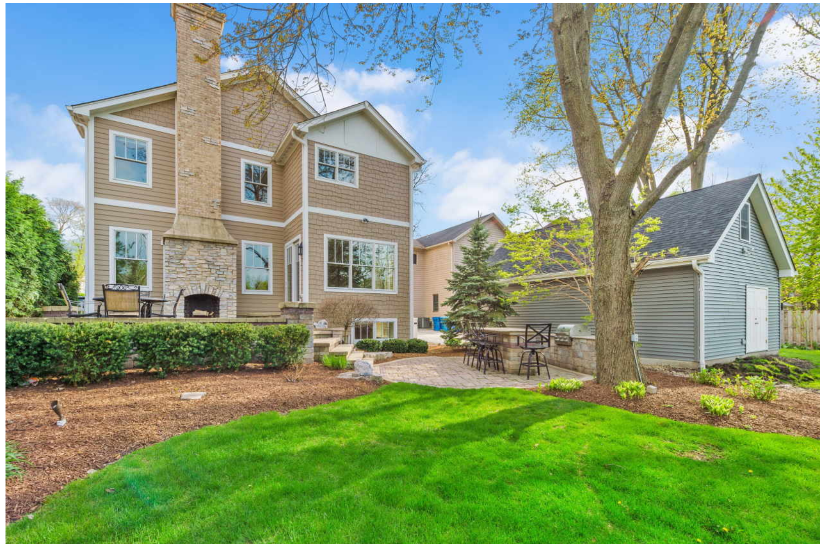
418 COLFAX AVENUE CLARENDON HILLS