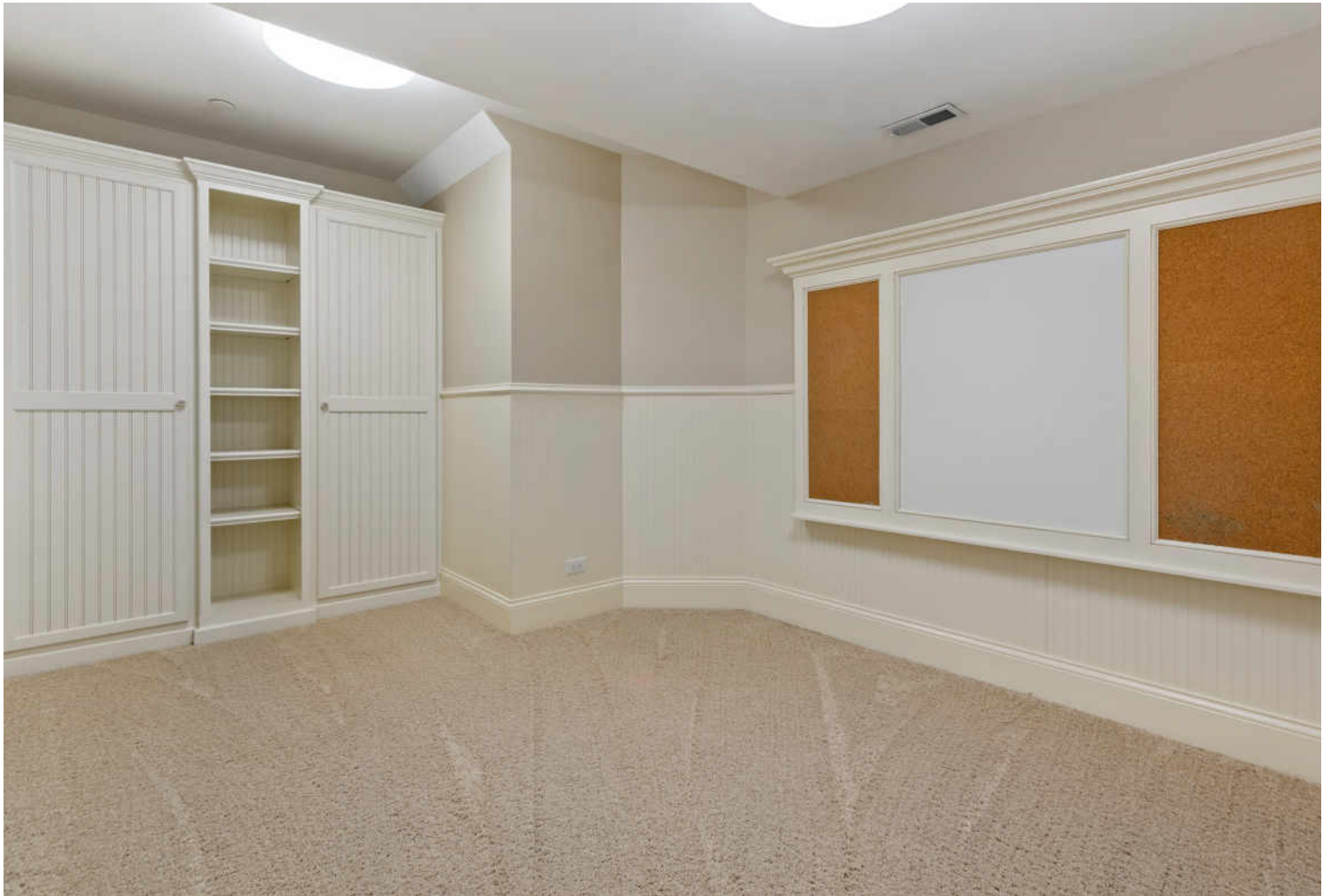
LOWER LEVEL PLAYROOM