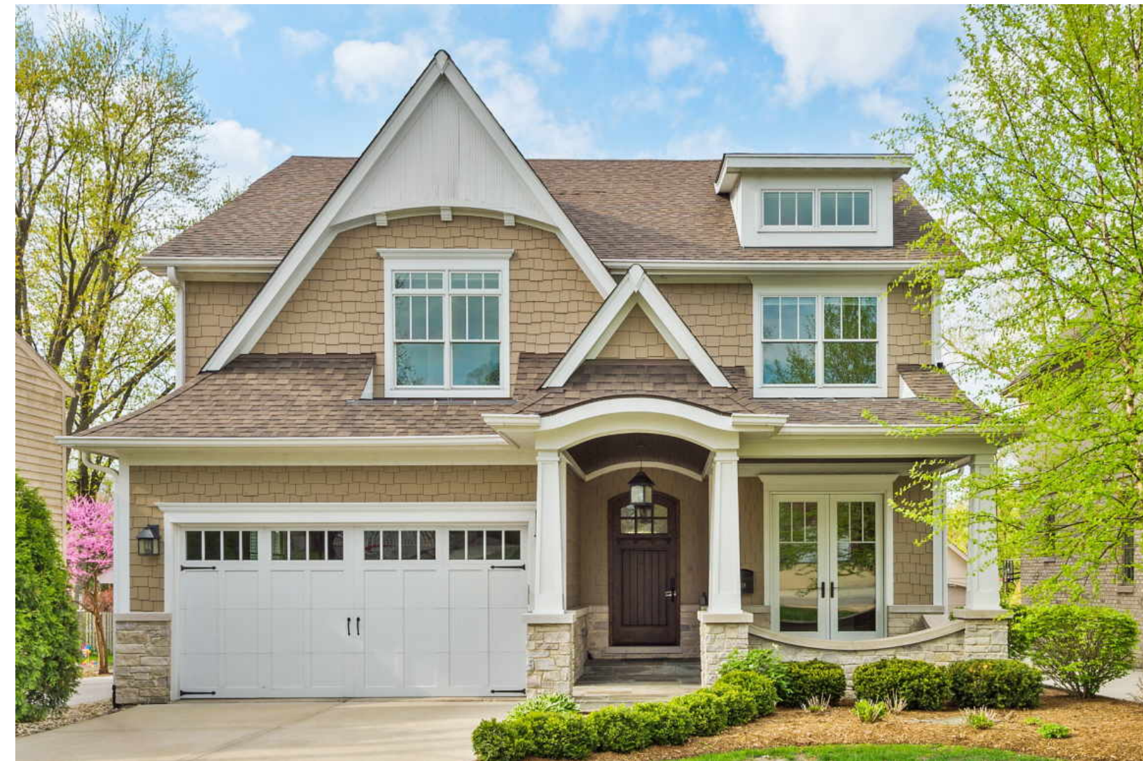
418 COLFAX AVENUE CLARENDON HILLS