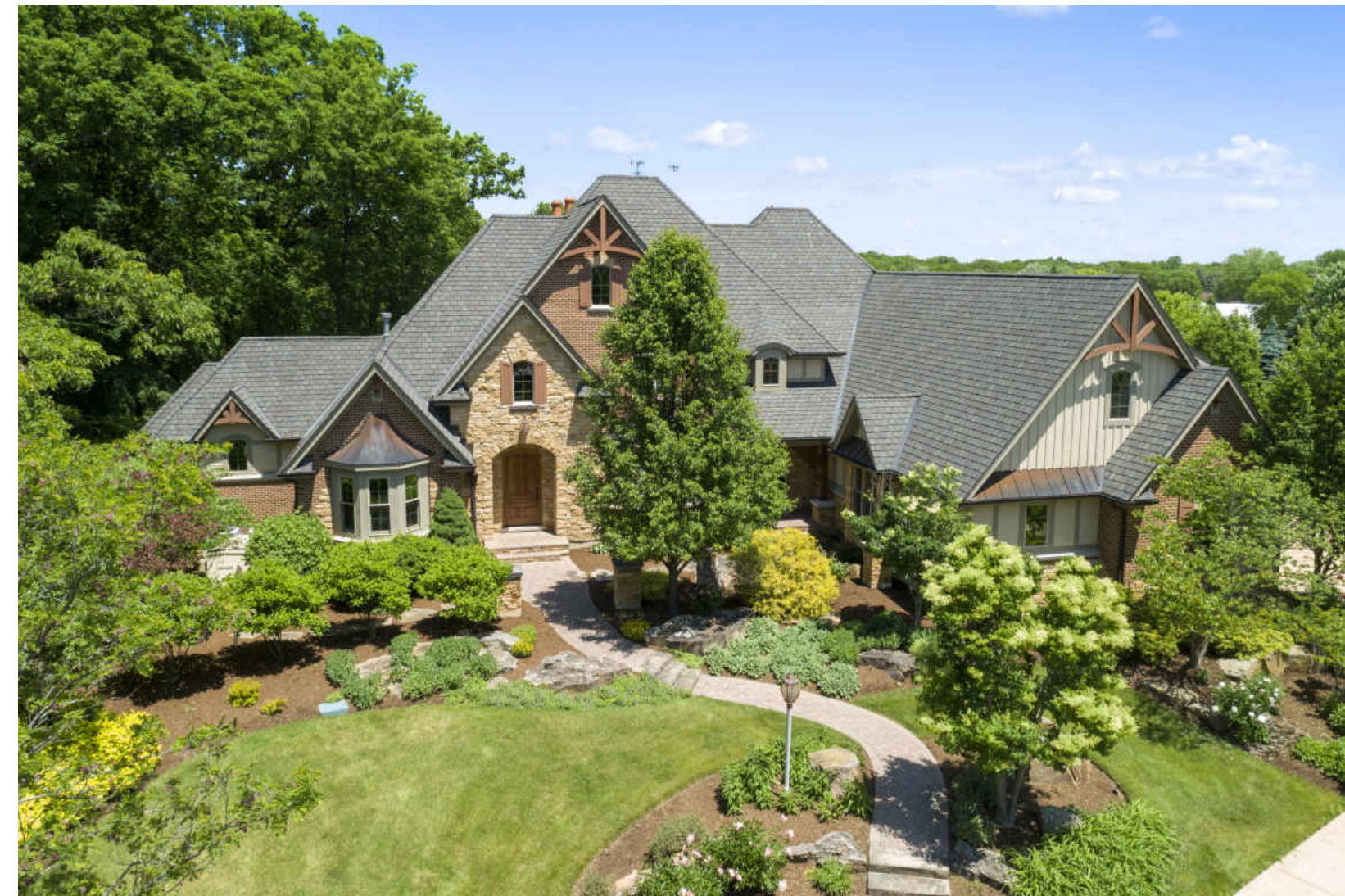
4N867 PRAIRIE WOODS COURT ST. CHARLES