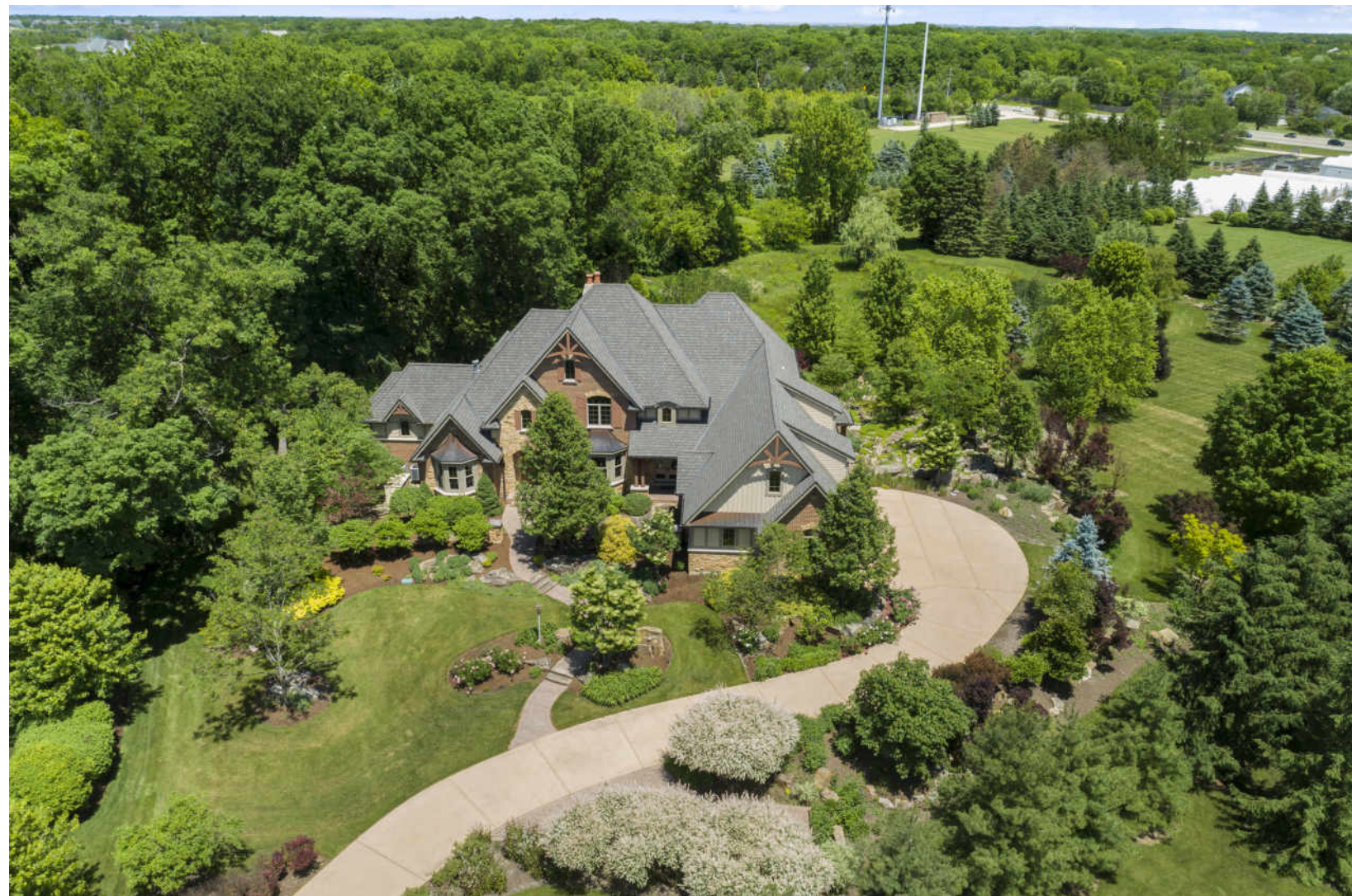
4N867 PRAIRIE WOODS COURT ST. CHARLES