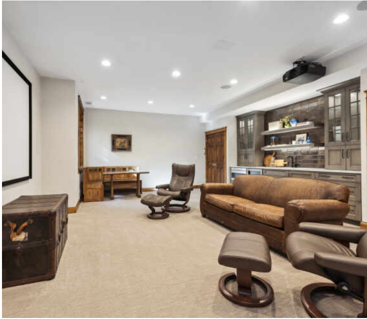
REC / MEDIA ROOM