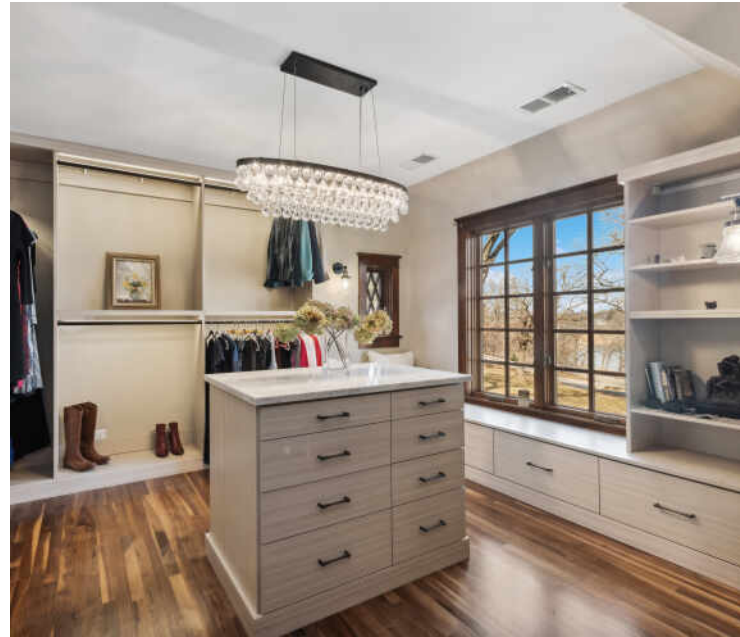
PRIMARY BEDROOM WALK IN CLOSET #1