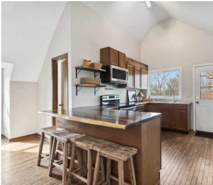
GUEST SUITE KITCHEN