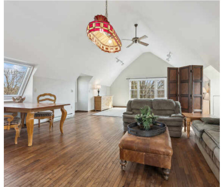
BONUS ROOM / GUEST SUITE