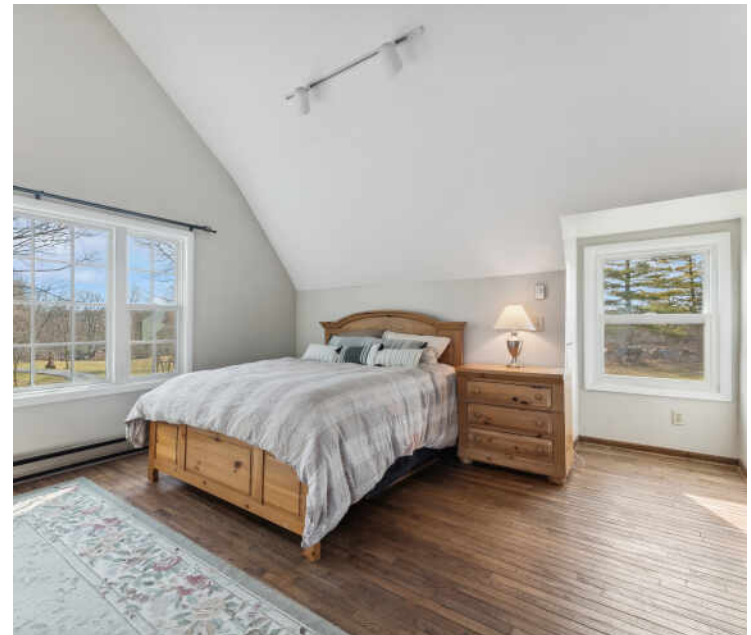
BONUS ROOM / GUEST SUITE