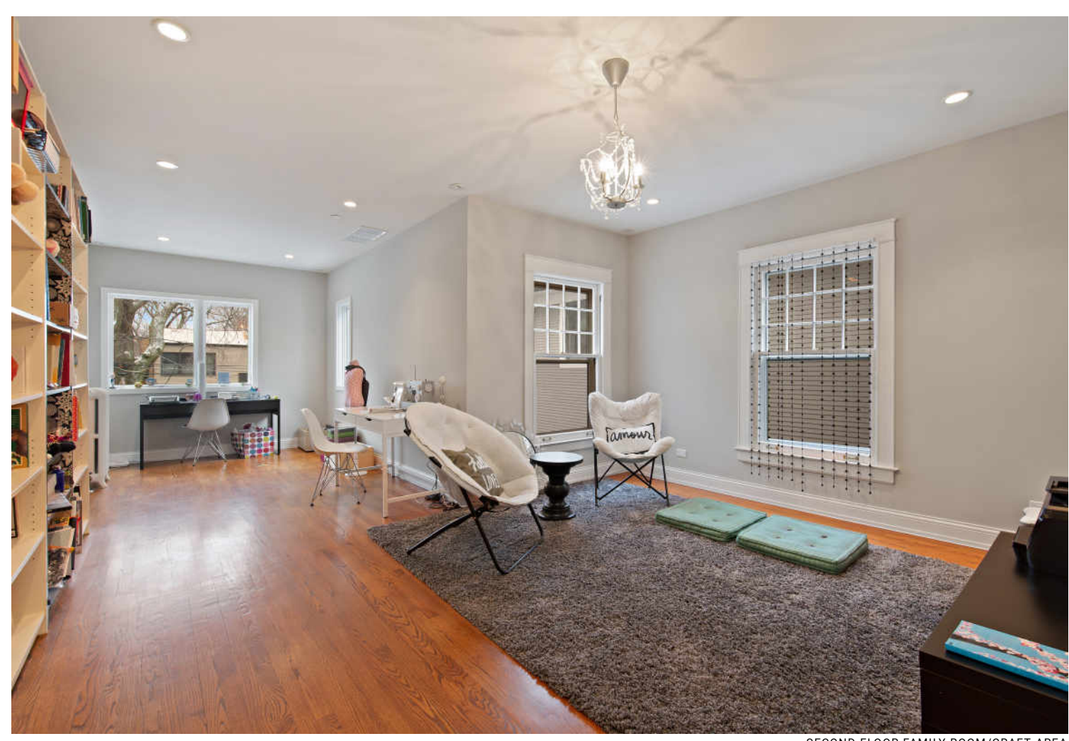
SECOND FLOOR FAMILY ROOM/CRAFT AREA