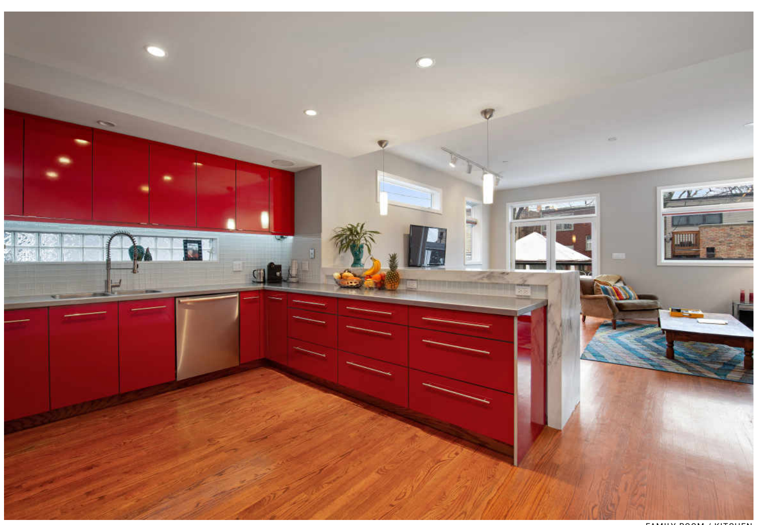
FAMILY ROOM / KITCHEN